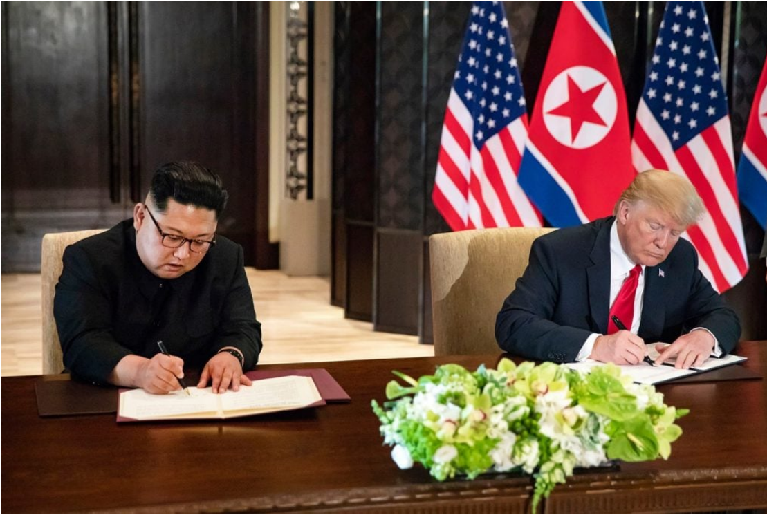
President Donald J. Trump and North Korean leader Kim Jong Un sign a joint statement | June 12, 2018

It seems that it is almost impossible for Trump to keep his promise, unless he is free from the “Washington Trap”.