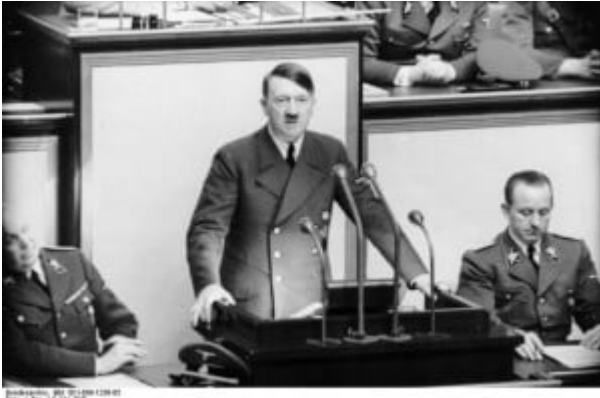
Hitler during the WWII

Imagine yourself in the middle of WWII. The Nazi clique ruling Germany basically won the war, having overrun subcontinental Europe in roughly two years and secured a period of calm. What would have happened if the Hitler had been able to cement this short-term victory, instead of precipitating the renewed warfare that finally ended the Nazi state? We shall never know, because he decided to advance into Eurasia against the politically and geographically isolated USSR. The Western allies seized upon the failure of the epic battle that unfolded in the east to launch their Normandy invasion. As in the past, their victory was assured only by a third party, this time the unlikely Soviet Marxists. They used the Soviet Union as a battering ram without having to lift a finger, at the cost of more than twenty-four million Soviet lives.