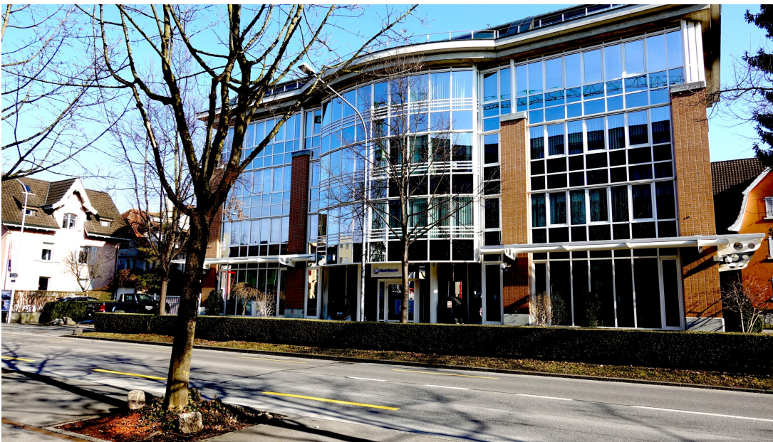
Nord Stream AG head office in Zug, Switzerland.

“The section of the pipe between the craters is destroyed, the radius of pipe fragments dispersion is at least 250 meters,” the report noted.