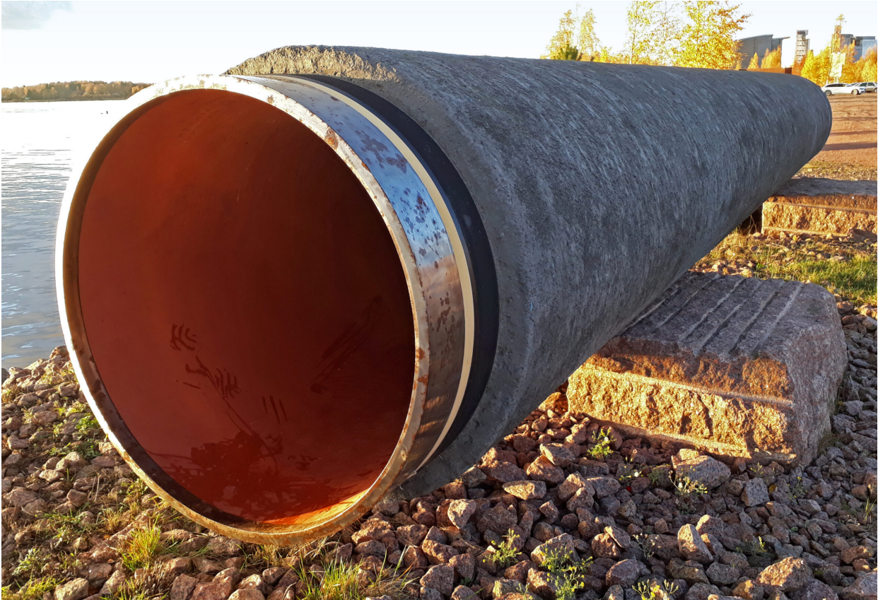
A piece of Nord Stream pipe on public display in Kotka, Finland in 2017.

At the location of the explosions, the Nord Stream pipelines consisted of 26.8 mm steel pipes with an addition 33.2 mm of concrete coating, for a total thickness of 60 mm. The weight of a single pipe section was over 11 tons.