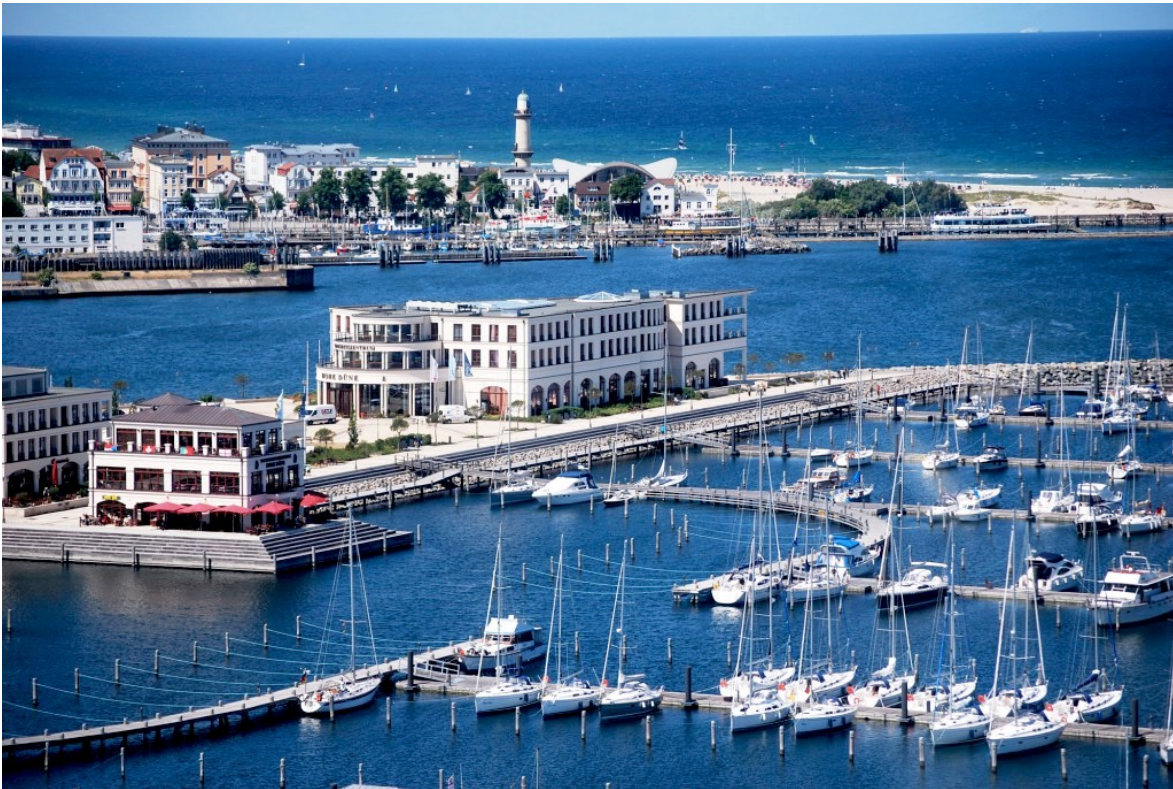
Marina in Rostock, Germany.

Take, for instance, the Tom Clancy-like tale of derring-do that has four allegedly Ukraine-affiliated divers defy physiology by conducting dives that would require the use of a decompression chamber for them to survive an ascent of 240 feet (the depth of the Nord Stream pipelines that were destroyed). A rule of thumb is that decompression takes approximately one day per 100 feet of seawater plus a day.