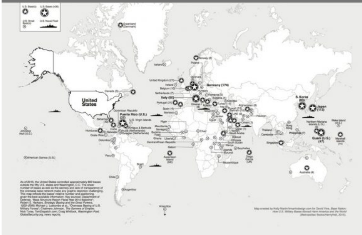
US foreign military bases as of 2015.