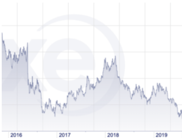
Image on the right: 6 Sep 2014 00:00 UTC – 5 Sep 2019 04:30 UTC GBP/USD close:1.22378

Since March this year – just six months, Sterling has depreciated 12% against the JPY, 9% against the USD, and nearly 8% against the EUR. In fact, every G10 and major EM currency has gained against GBP over this period. The ‘markets’ are now moving towards no-deal – and the warnings are getting more stern – “sterling appears very vulnerable on two additional and interrelated fronts: economic data developments and central bank stance. On balance, we think there is further room for sterling to depreciate against majors (USD, EUR, JPY and CHF) in the weeks ahead, amid a confluence of negative factors.”