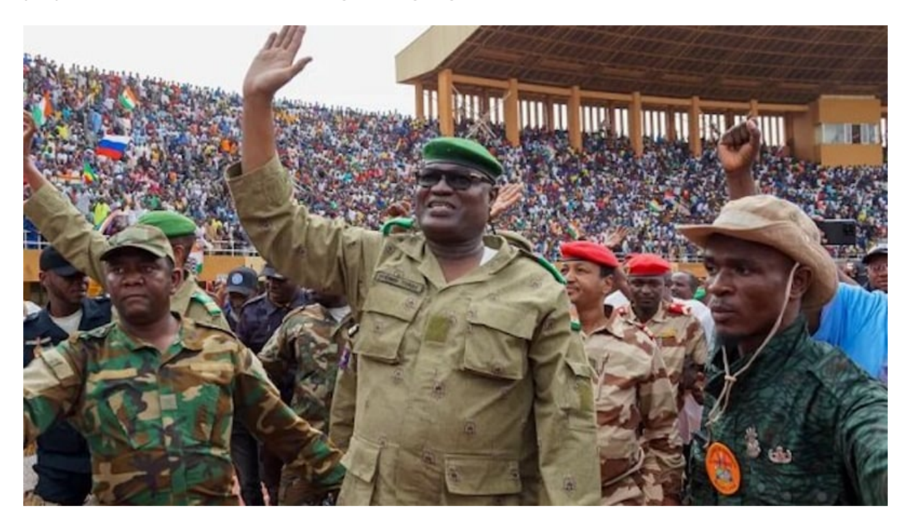
Niger CNSP leaders greet masses and political rally

However, their purported shift to a more diplomatic approach to the situation in Niger is a reflection of the widespread opposition to a military intervention by various sectors of the population and political structures in the ECOWAS states. The Nigerian Senate, which is dominated by President Tinubu's own party, the All-Progressive Congress (APC), rejected his proposal for an intervention in neighboring Niger.