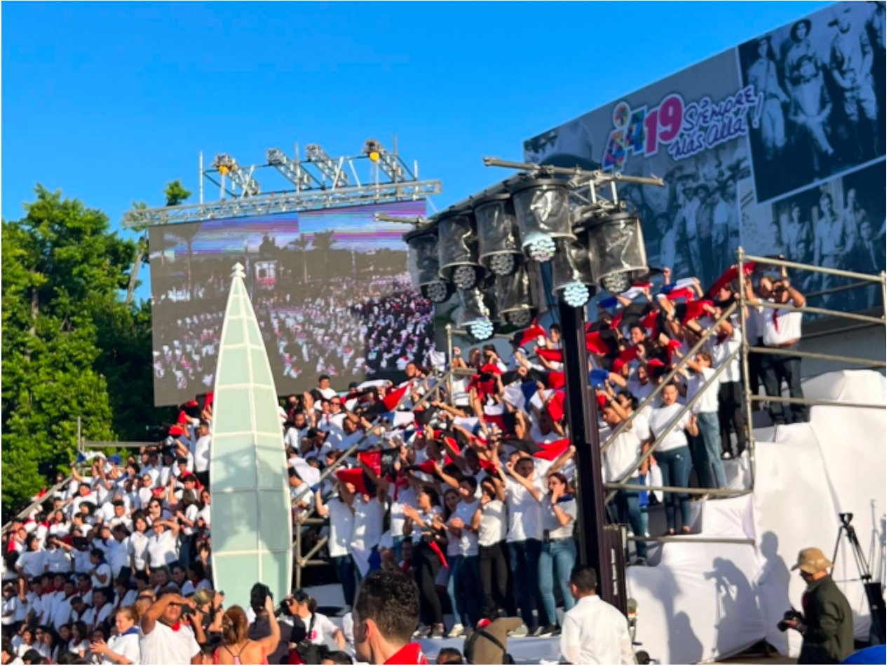
Youth celebrate 44 th anniversary of Sandinista revolution in Managua on July 19, 2023.

On July 19, 1979, the Sandinista People's Revolution Party, Frente Sandinista de Liberación Nacional (FSLN), overcame the U.S.-installed puppet dictator dynasty, headed by the Somoza family. Below is a photo of a U.S. tank taken by the FSLN that hangs in the former torture facility and prison run by Somoza's death squads in the city of León.