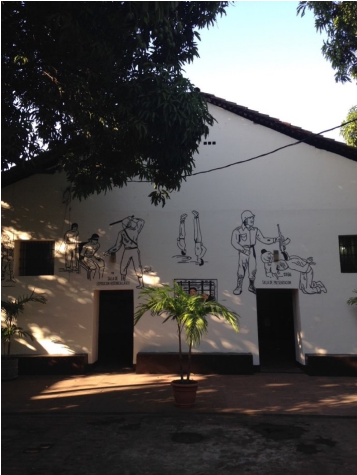
Former torture facility and prison run by Somoza's death squads in the city of León.