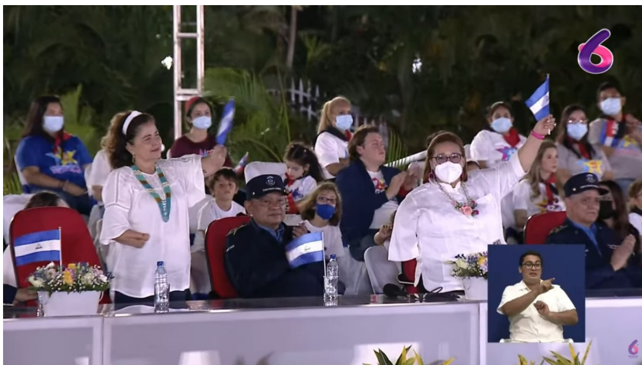
Sandinista women who lost their hands and arm in the revolutionary struggle, honored by President Daniel Ortega on the 42nd anniversary celebration

“And there they are doing the calculations where they are carrying out investigations into the infamous foundations, and millions of dollars are showing up here, millions there, and we are talking about millions of dollars to be used to try to destroy the Nicaraguan people. And they have failed.”