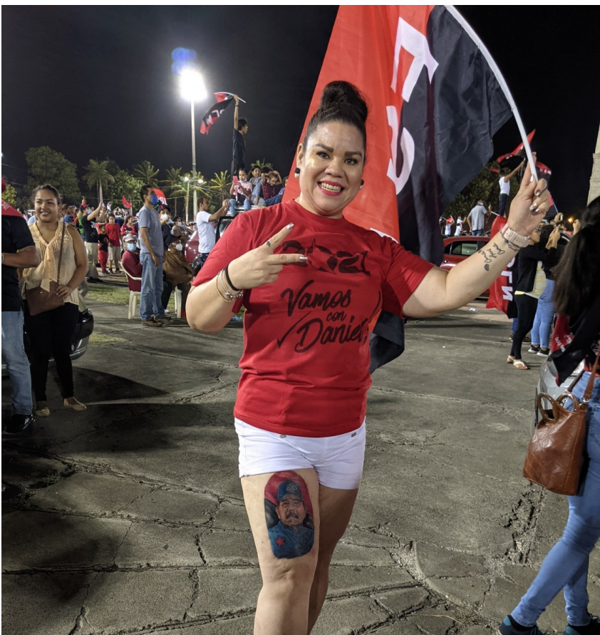
While tens of thousands of Nicaraguans filled Managua's Plaza La Fe and Avenida Bolívar on the night of July 18, many more held large community parties, called vigilias , in working-