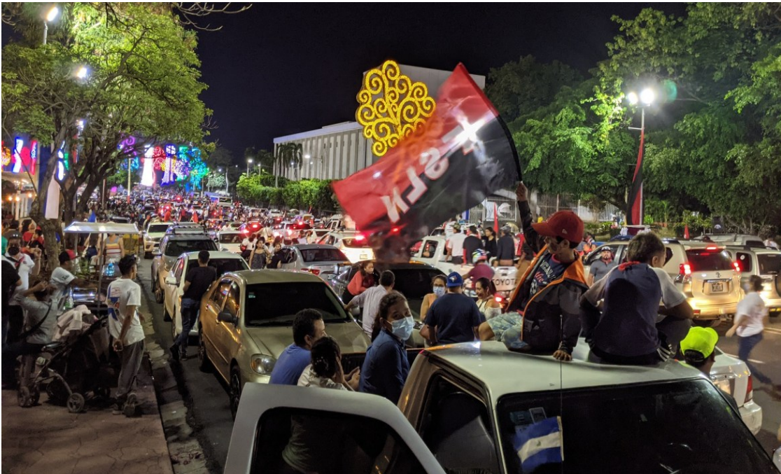
During a midnight fireworks launch, Nicaraguans blasted revolutionary music from their cars, and partied into the early morning.