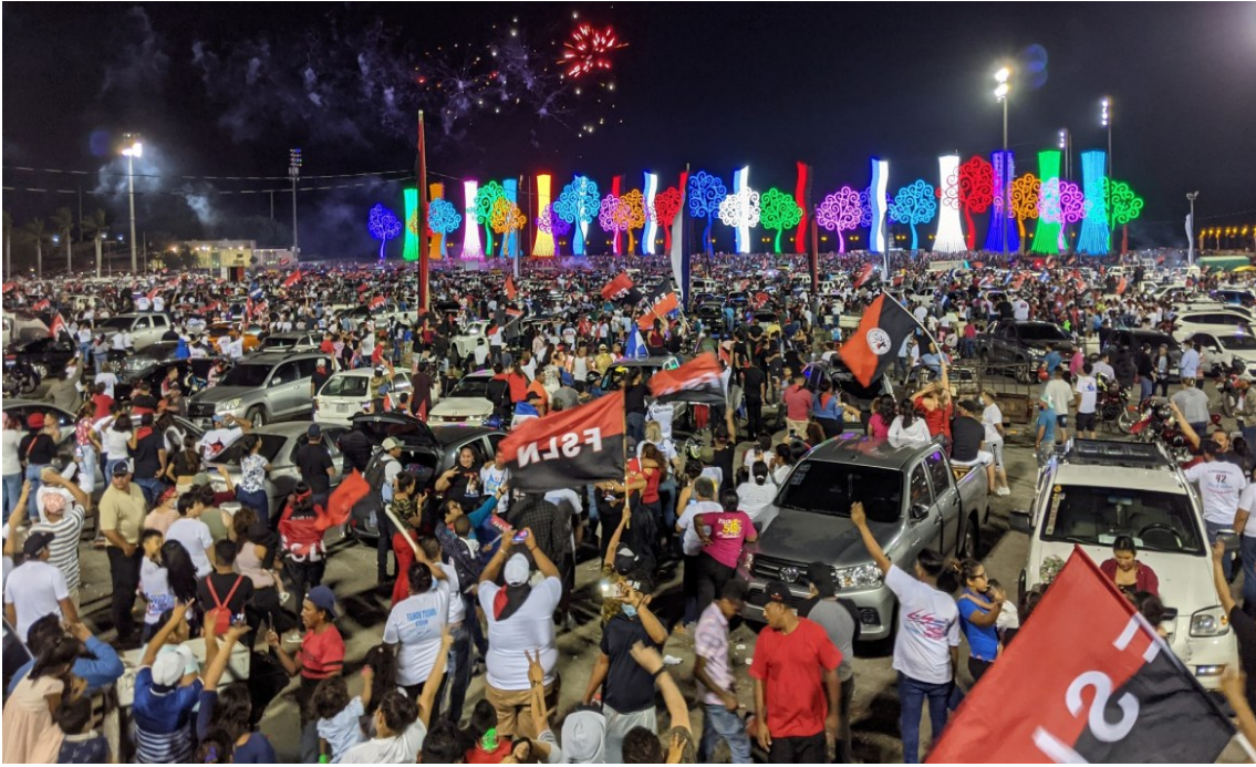
A long line of cars stretched all the way down Avenida Bolívar. Sandinistas were willing to sit in hours of traffic to attend.