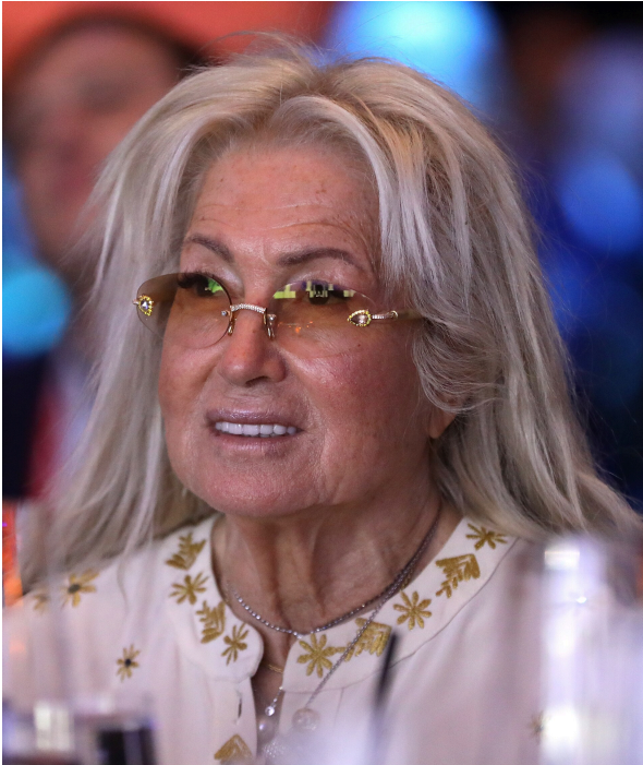
Image: Miriam Adelson at the Republican Jewish Coalition's 2023 Annual Leadership Summit at the Venetian Convention & Expo Center in Las Vegas, Nevada.