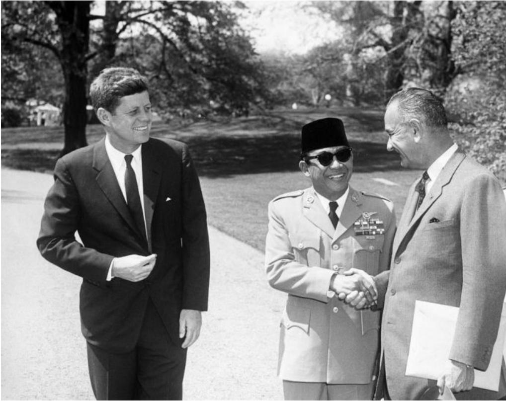
Kennedy, Sukarno and Johnson.

LBJ also started increasing the U.S. intervention in Vietnam on November 29, 1963, well before the fake “Gulf of Tonkin incident” led to the Johnson administration fully engaging in what would be a losing war with North Vietnam. [23] American involvement in Vietnam would lead to at least 60,000 American deaths and countless more injuries, as well as a reported two million Vietnamese deaths. [24]