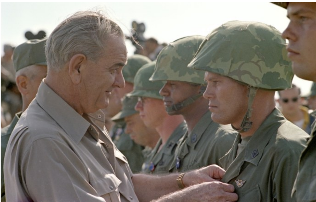
LBJ pins medal on U.S. soldier at Cam Ranh Bay, South Vietnam, in 1967.

LBJ also started increasing the U.S. intervention in Vietnam on November 29, 1963, well before the fake “Gulf of Tonkin incident” led to the Johnson administration fully engaging in what would be a losing war with North Vietnam. [23] American involvement in Vietnam would lead to at least 60,000 American deaths and countless more injuries, as well as a reported two million Vietnamese deaths. [24]