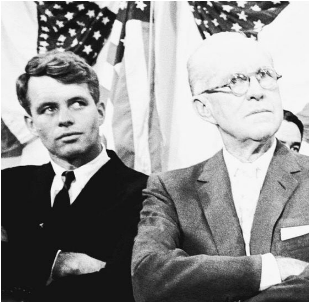
Robert Kennedy and Joseph Kennedy, Sr., listen to John’s presidential victory speech in November 1960.

Stone then shows Robert Kennedy, Jr. , speaking about his father’s reaction: “My father’s first call [after the assassination] was to the CIA desk officer, asking ‘Did your people conduct this horror?!’”