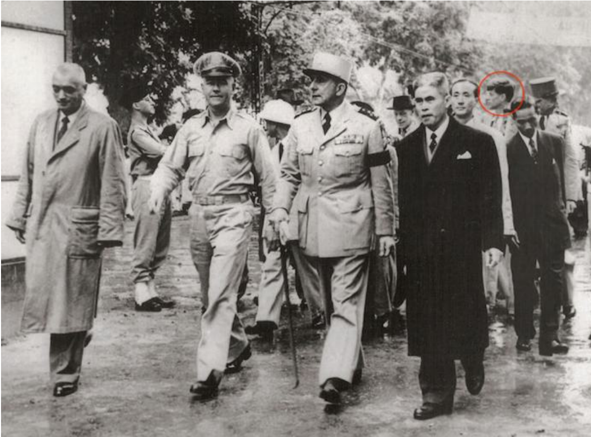
JFK, when a congressman, during tour of Vietnam in 1951.

JFK also ended up giving a famous speech in the Senate in 1957 entitled “Imperialism: The Enemy of Freedom,” in which he called for supporting anti-colonialism in Africa and Asia. [6] This brought the wrath of both Democrats and Republicans on him.