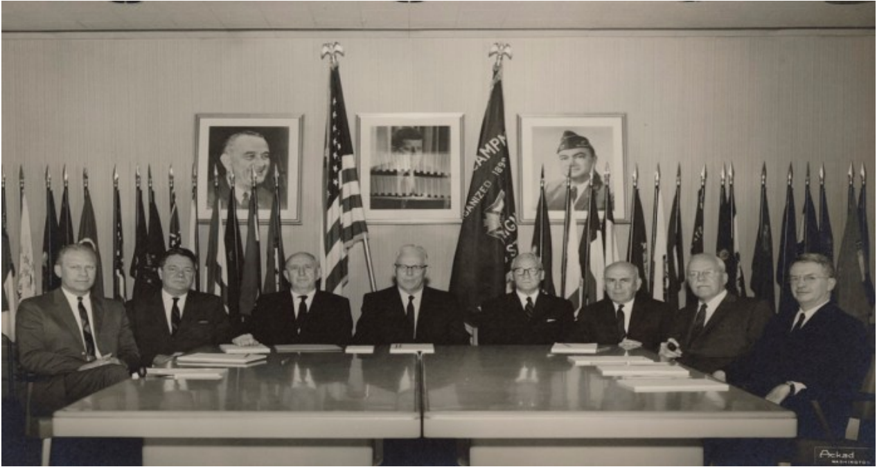
The Warren Commission. Pictured are members Gerald Ford, Hale Boggs, Richard Russell, Jr., Earl Warren, John Sherman Cooper, John J. McCloy, Allen Welsh Dulles and General Counsel J. Lee Rankin.

Two days after President Kennedy's assassination and Lee Harvey Oswald's arrest, Jack Ruby approached Oswald as he was being escorted in front of police and journalists in the police station garage, and fatally shot him.