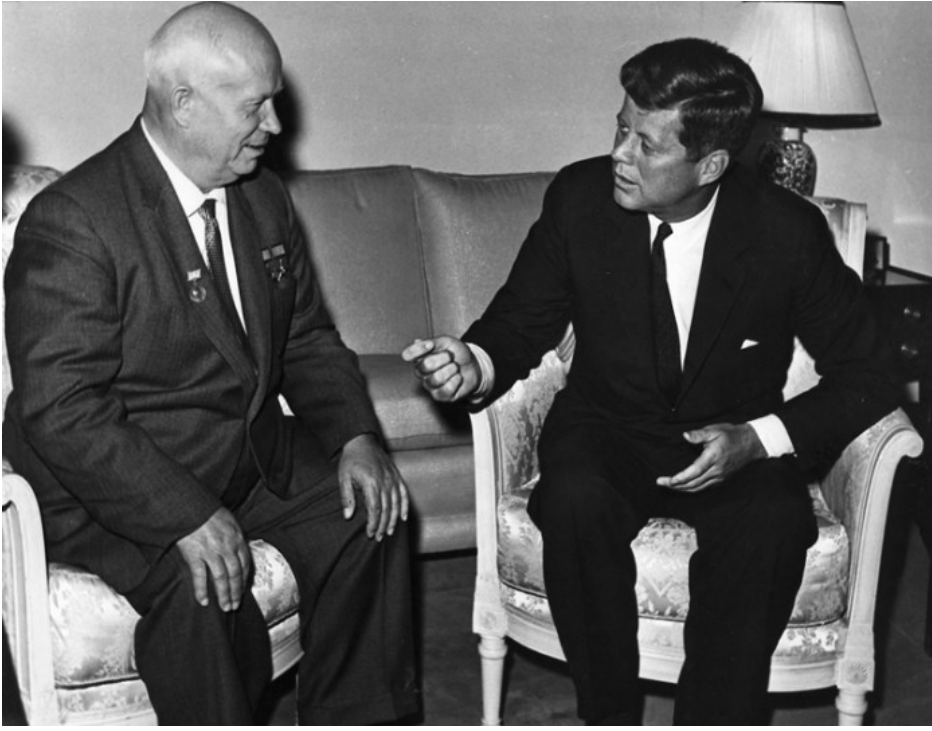
JFK and Soviet Premier Nikita Khrushchev in 1961.

President Kennedy's final blow against the war-mongering oligarchs came when he decided against sending American ground troops into Vietnam, and ordered an eventual complete pull-out of American involvement there.