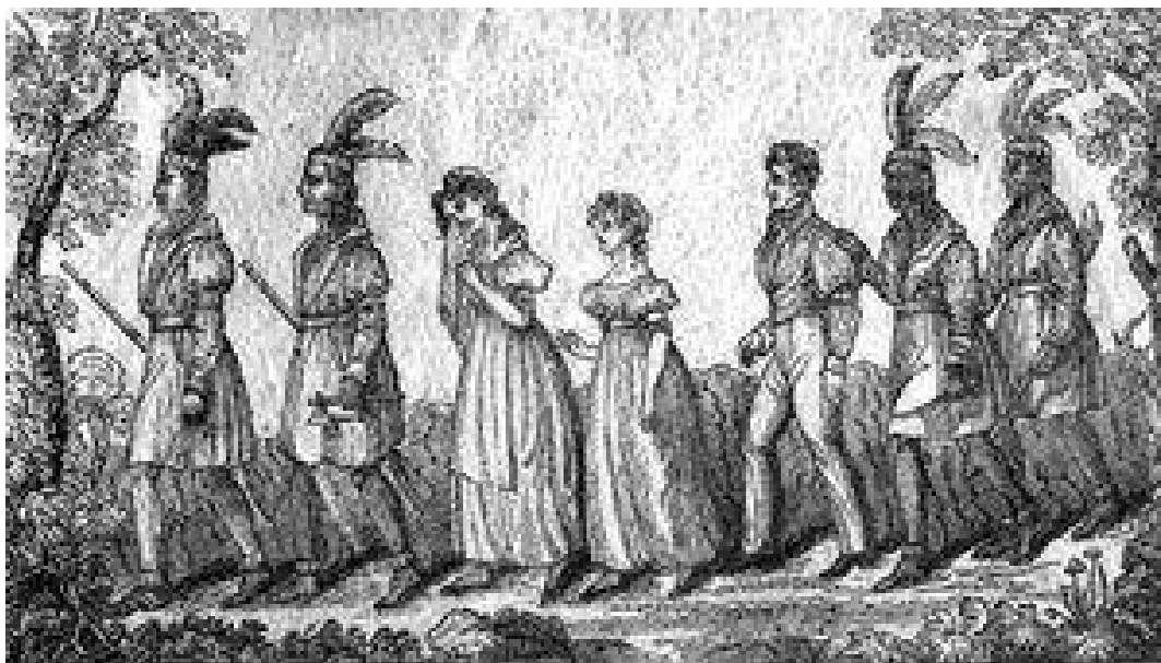
Illustration of captives in the Indian Wars.

These stories are about a complex mix of violence against captives, temptations to stay with their captors, the ideal to remain loyal with their fellow colonists, and their Christian beliefs.