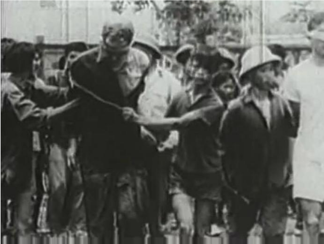
James Stockdale while in captivity.

With post-war military careers at stake, these high-ranking officers played up the alleged barbarity of the North Vietnamese, demanded resistance to interrogations from other captives, and threatened so-called deviants with disciplinary charges after release to the U.S.