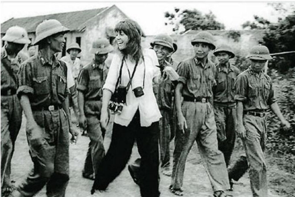
Jane Fonda (center) during trip to North Vietnam in 1972.