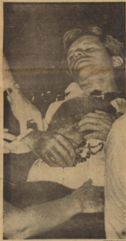
SEN. KENNEDY CLUTCHES ROSARY BEADS ON FLOOR OF HOTEL. A former ministry student pushed through crowd, headed heads in victim.