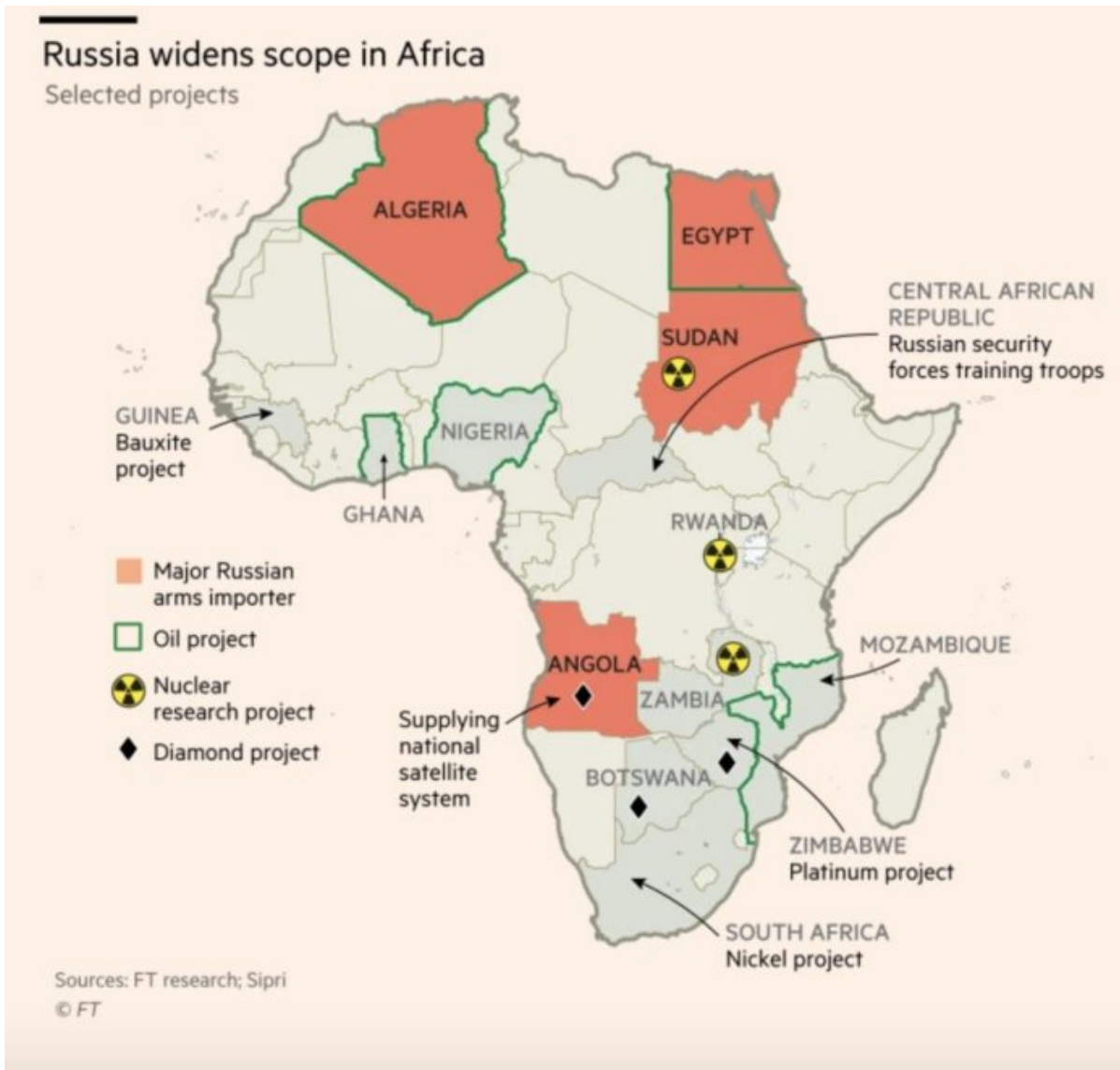
Map warns of growing Russian influence in Africa—shades of the Cold War.

“The United States not only stands with the people of Ukraine, but with all innocent people who have been victimized by Putin’s mercenaries and agents credibly accused of gross violations of human rights in Africa, including in the Central African Republic and Mali. This bill enlists the resources of the State Department and other federal agencies to examine the Russian Federation’s malign activities in Africa and hold those complicit in these activities to account. The United States will not sit by and watch Putin’s war machine attempt to gain strength to the detriment of fragile states in Africa and elsewhere.”