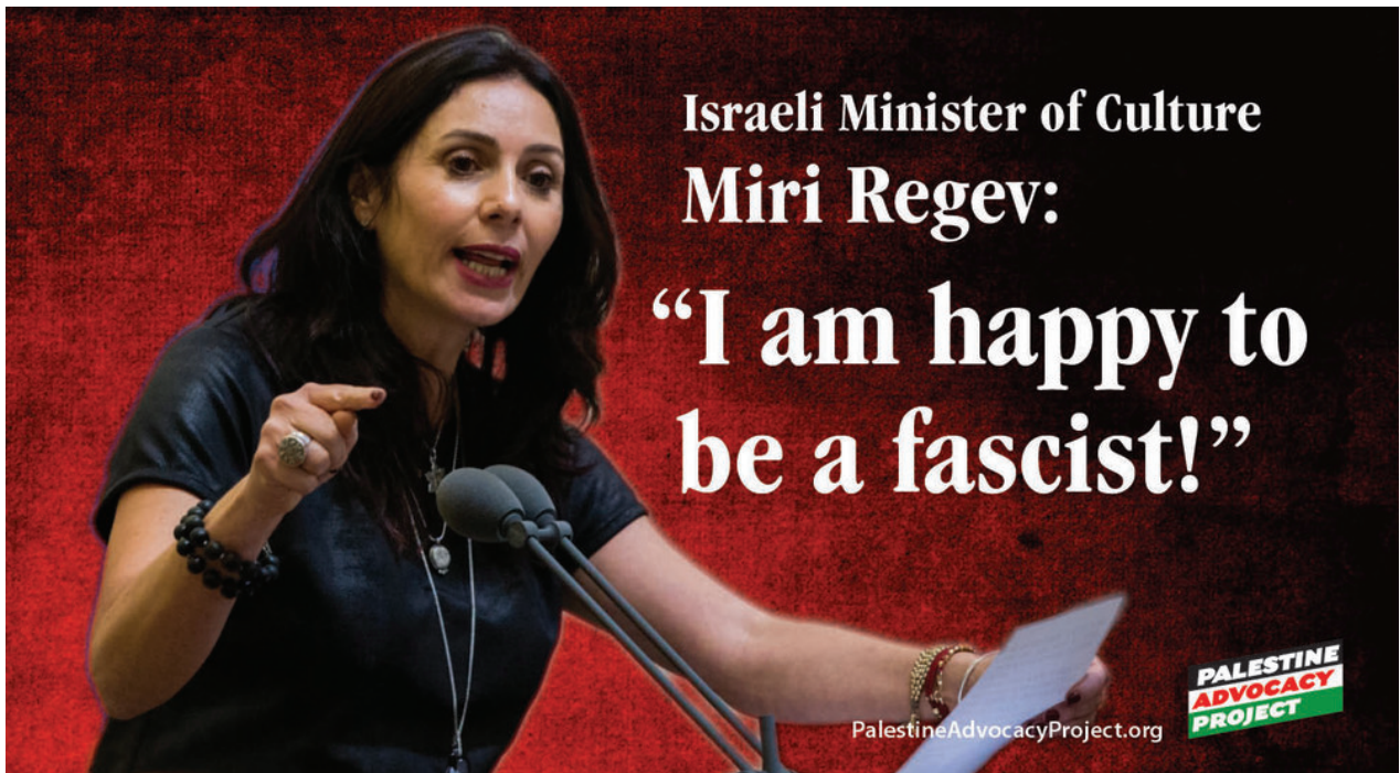
Image: Miri Regev, Israeli Minister of Culture and Sport: “I am happy to be a fascist” (Graphic: Palestine Advocacy Project)

and asks “How are these politicians that are so quick to accuse people of being anti-Israel or anti-Semitic the same ones using fascist language to describe an entire group of people?”