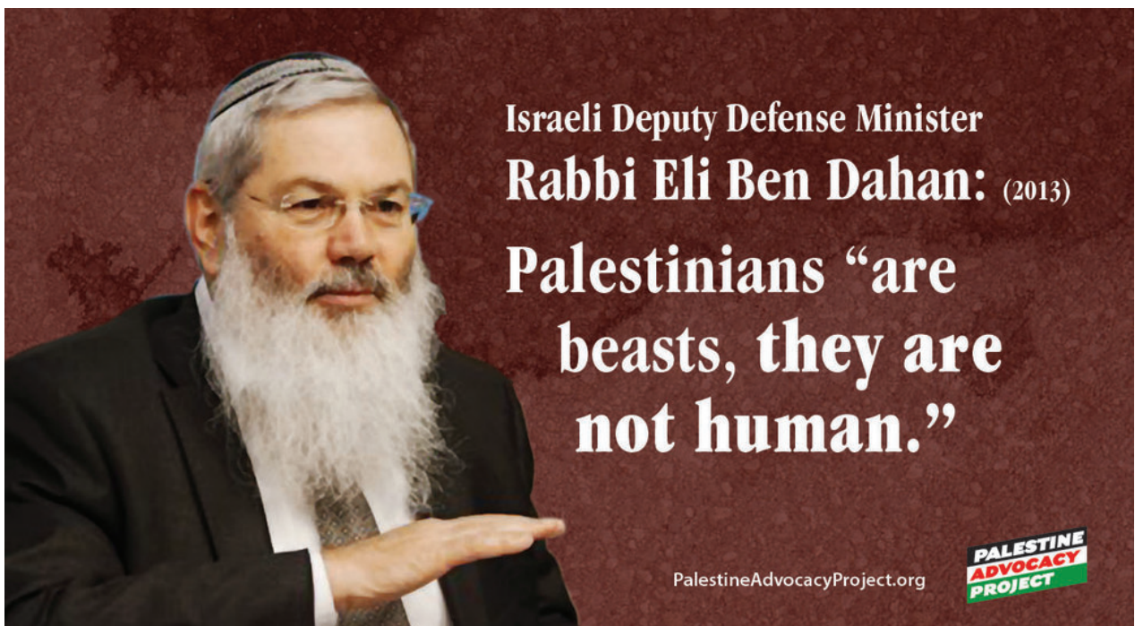
Image: Israeli deputy defense minister Rabbi Eli Ben Dahan “[Palestinians] “are beasts, they are not human.” (Graphic: Palestine Advocacy Project)

One of the ads features Israel’s deputy defense minister, Rabbi Eli Ben Dahan, who heads the army’s “Civil Administration” (occupation) of the West Bank supervising the theft of Palestinian land as well as granting and revoking entry and travel permits for Palestinians. He says Palestinians are beasts: