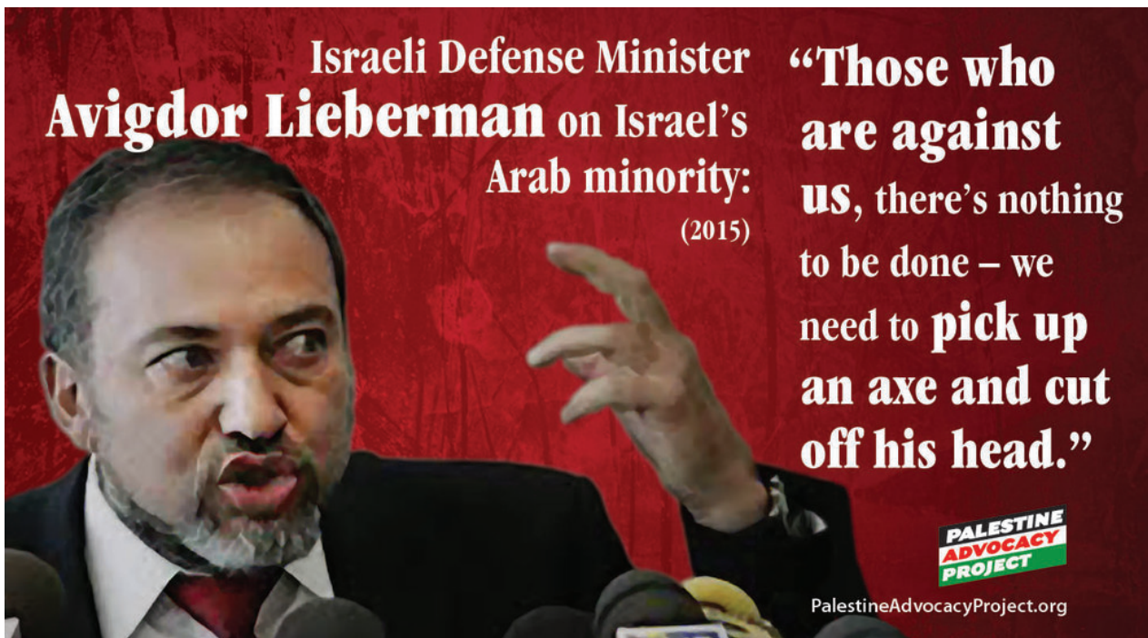
Image: Israeli Defense Minister Avigdor Lieberman "Those who are against us, there's nothing to be done - we need to pick up an ax and cut off his head"

The In Their Own Words series was created to spark conversation on U.S. college campuses seldom featured in the mainstream media. Thus far nine college campuses, including University of California-Berkeley, have agreed to publish ads in their campus newspapers.