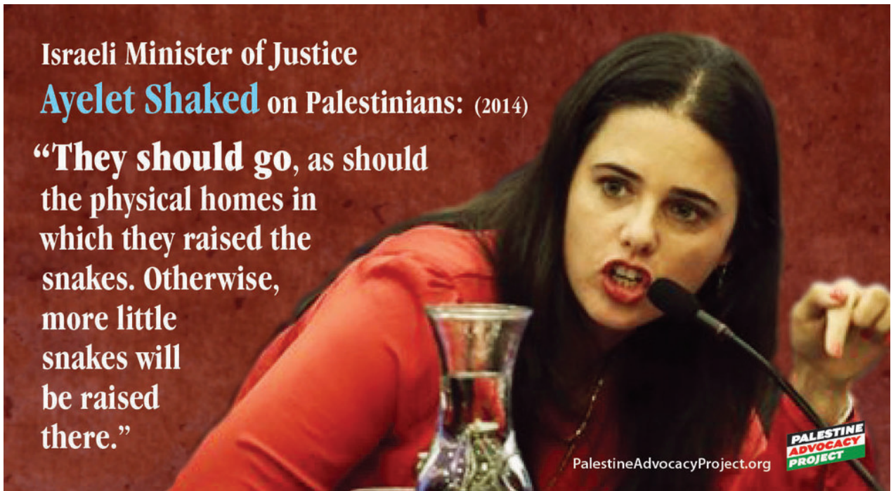
Image: Israeli Minister of Justice Ayelet Shaked “They should go, as should the physical homes in which they raised the snakes. Otherwise, more little snakes will be raised there.” (Graphic: Palestine Advocacy Project)

One of the ads features Israel’s deputy defense minister, Rabbi Eli Ben Dahan, who heads the army’s “Civil Administration” (occupation) of the West Bank supervising the theft of Palestinian land as well as granting and revoking entry and travel permits for Palestinians. He says Palestinians are beasts: