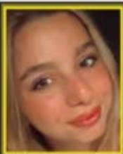
Shirat Yam Amer