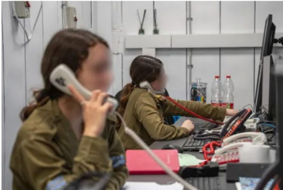
IDF spotters working at the IDF base in Nahal Oz.