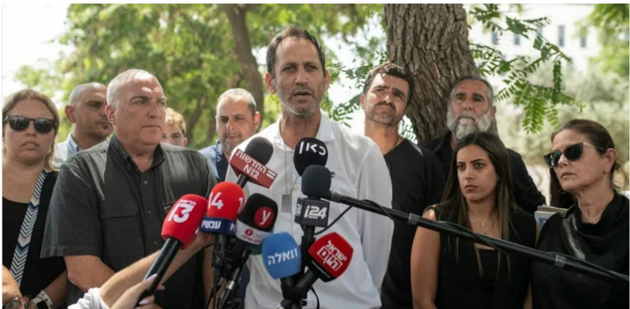
Parents of IDF spotters that were killed at the Nahal Oz outpost, giving a statement before meeting with the prime minister, on Tuesday.

The parents of the spotters have become organized and they are bringing their views to the Israeli Prime Minister. From a Haaretz report we learn ,