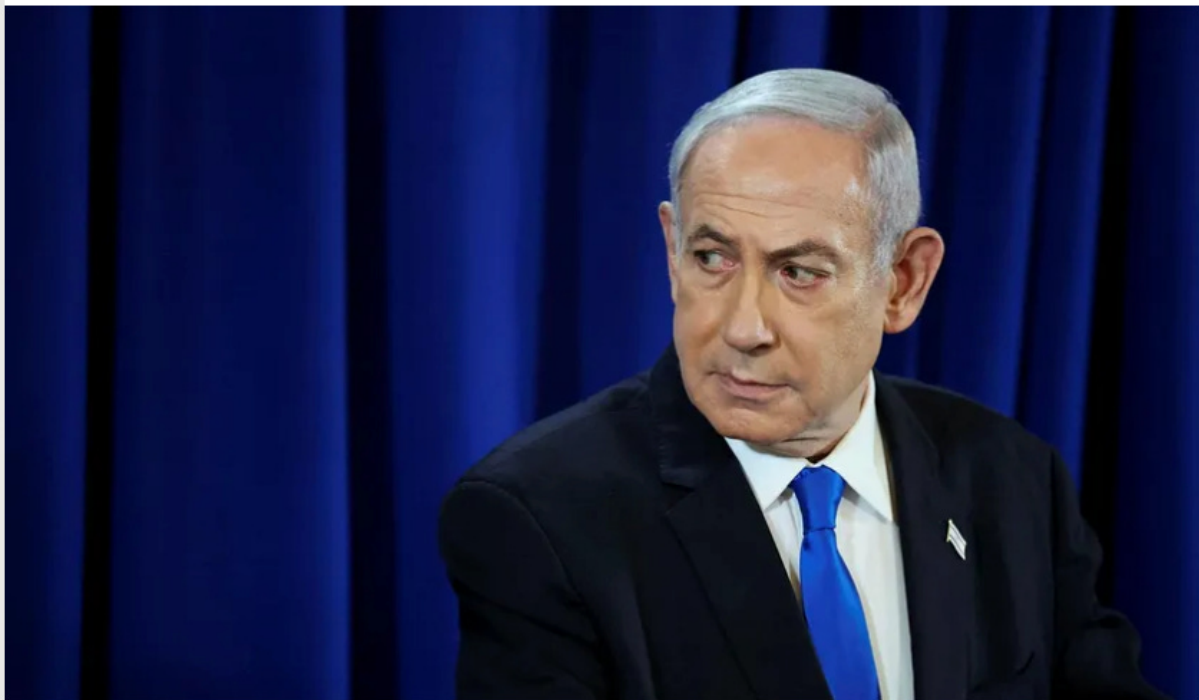
Israeli Prime Minister Benjamin Netanyahu pauses during a press conference in Tel Aviv, Israel, in July.