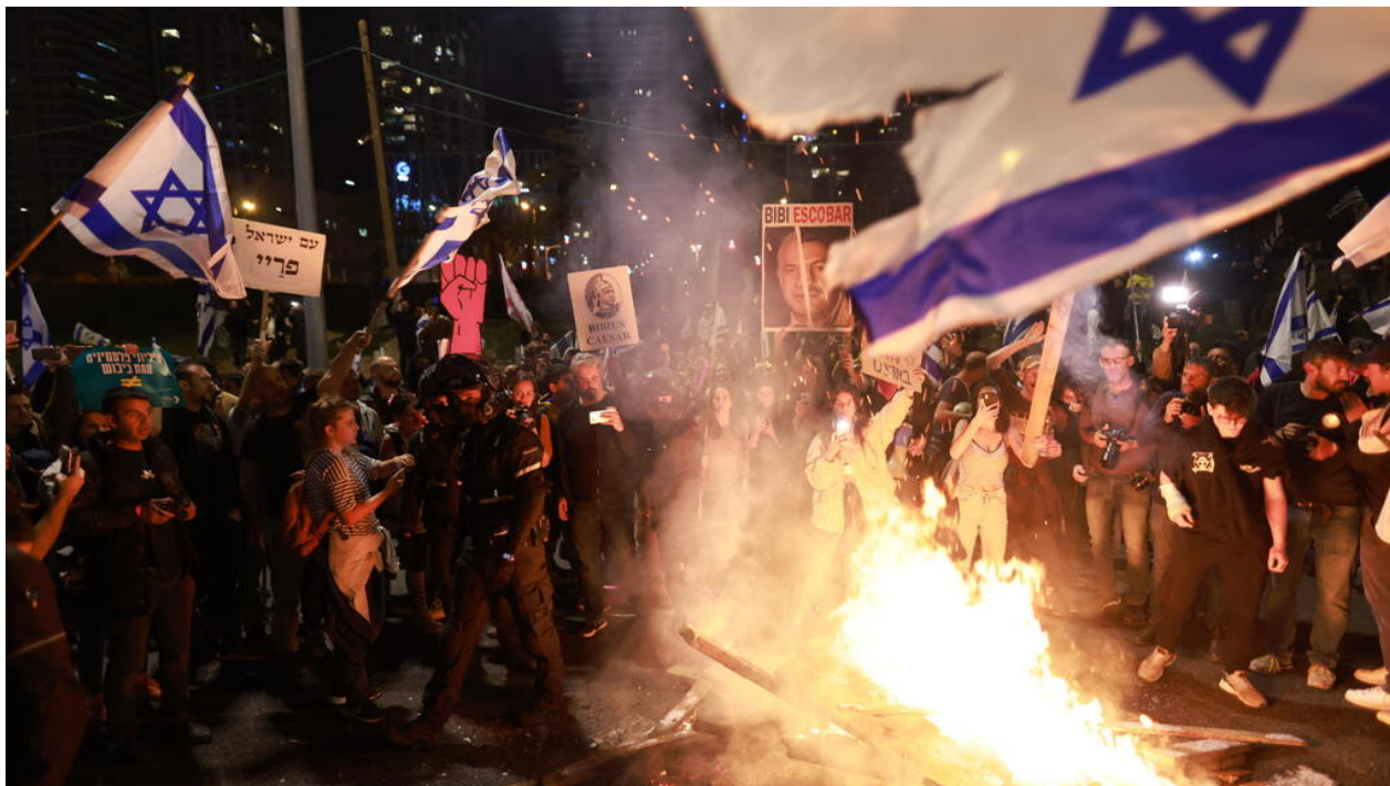
Israeli demonstrations in recent months have escalated as reform legislation proceeds

Tens of thousands of Israelis have taken to the streets over the past two months to protest the sweeping overhaul. Protests last week were so large that Netanyahu was forced to take a helicopter to the airport in order to catch a flight for an official visit to Italy.