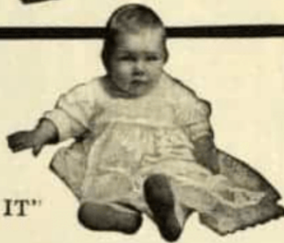
"RAISED ON IT"