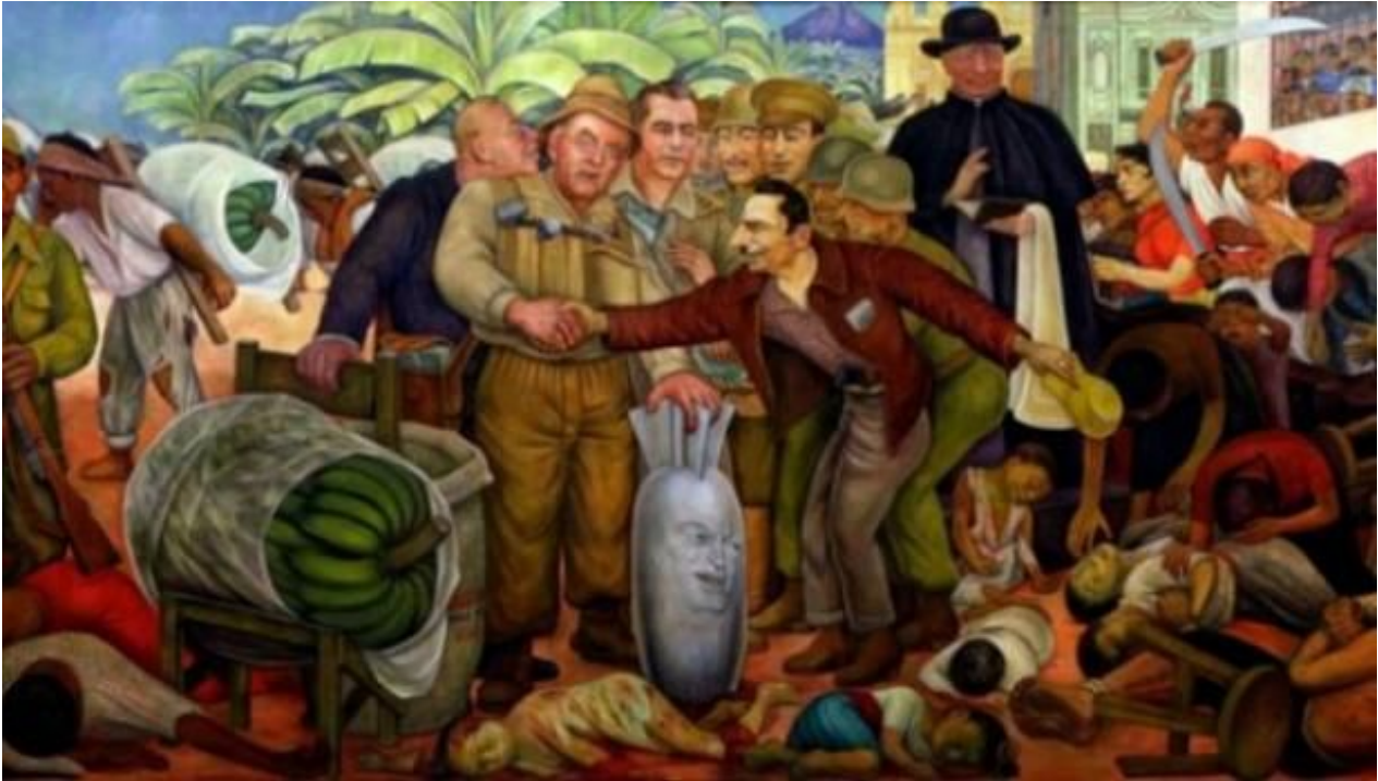
Diego Rivera's famous painting "Glorious Victory" about United Fruit and the 1954 coup in Guatemala, hanging in Moscow's Pushkin Museum.

With Nestlé, the United States has already worked to fight lawsuits and dismiss charges attempting to hold Nestlé accountable for horrendous human rights violations. The U.S. is apparently happy to race to the bottom, hand-in-hand with these monstrous corporations. The corporation and the state have already become one institution, with extensive centralized economic power, and increasingly destructive behavior.