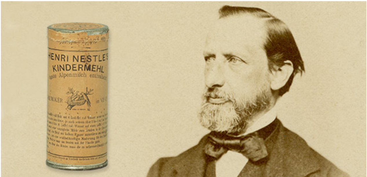
Henri Nestlé

The Nestlé name is widely associated with a controversy. Nestlé's success is arguably due to its incredible brutality—from inventing the need for mass-scale baby formula leading to the deaths of infants, or redirecting much needed water from impoverished areas to bottle and sell back to the same communities, to exploiting child labor and slavery to gather ingredients for consumer products it admits have no nutritional value—Nestlé is an incredibly unethical company.