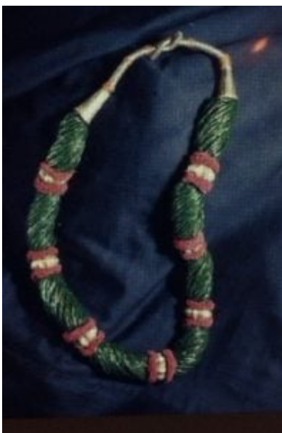
My Limbu naugiri

A Limbu naugiri embodies a whole set of sentiments which I cannot possibly untangle, identify and comprehend. It’s not a dowry. It does not in itself mark one’s marital status. My naugiri it does not reflect a personal indulgence in ornamentation. I myself wear no bangles, bracelets or earrings. (My neighbors had already noted this, with some dismay.) Nevertheless these Limbu companions really want me to take this piece of jewelry with me when I depart. Curio or art, it is a gift to me wrapped in their memories. It symbolizes our bond and the cooperative spirit of our months together.