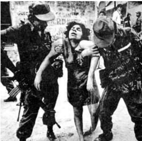
Salvador Death Squads

In Latin America, the military dictatorships of the 1960s and 1970s have in large part been replaced by US proxy regimes, i.e. a democratic dictatorship has been installed which ensures continuity. At the same time the ruling elites in Latin America have remoulded. They have become increasingly integrated into the logic of global capitalism, requiring an