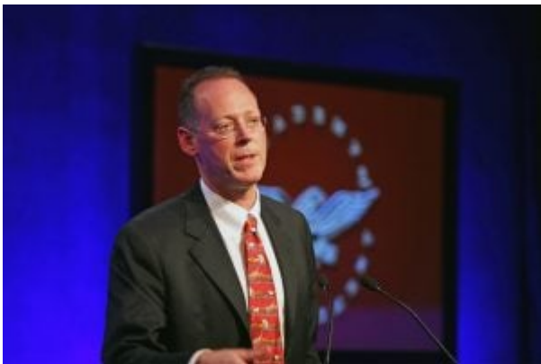
Dr. Paul Farmer

In Tax Haven Cash Rising, Now Equal To At Least 10% Of World GDP , Forbes situates it within a web of financial networks: “a large fraction of the money held in Switzerland belongs on paper to shell companies, trusts, foundations, and personal holding companies incorporated in other tax havens. A significant percentage of the offshore wealth managed by Swiss banks belongs to people whose primary accounts, or entities, are based in the British Virgin Islands, Panama, or Jersey.”