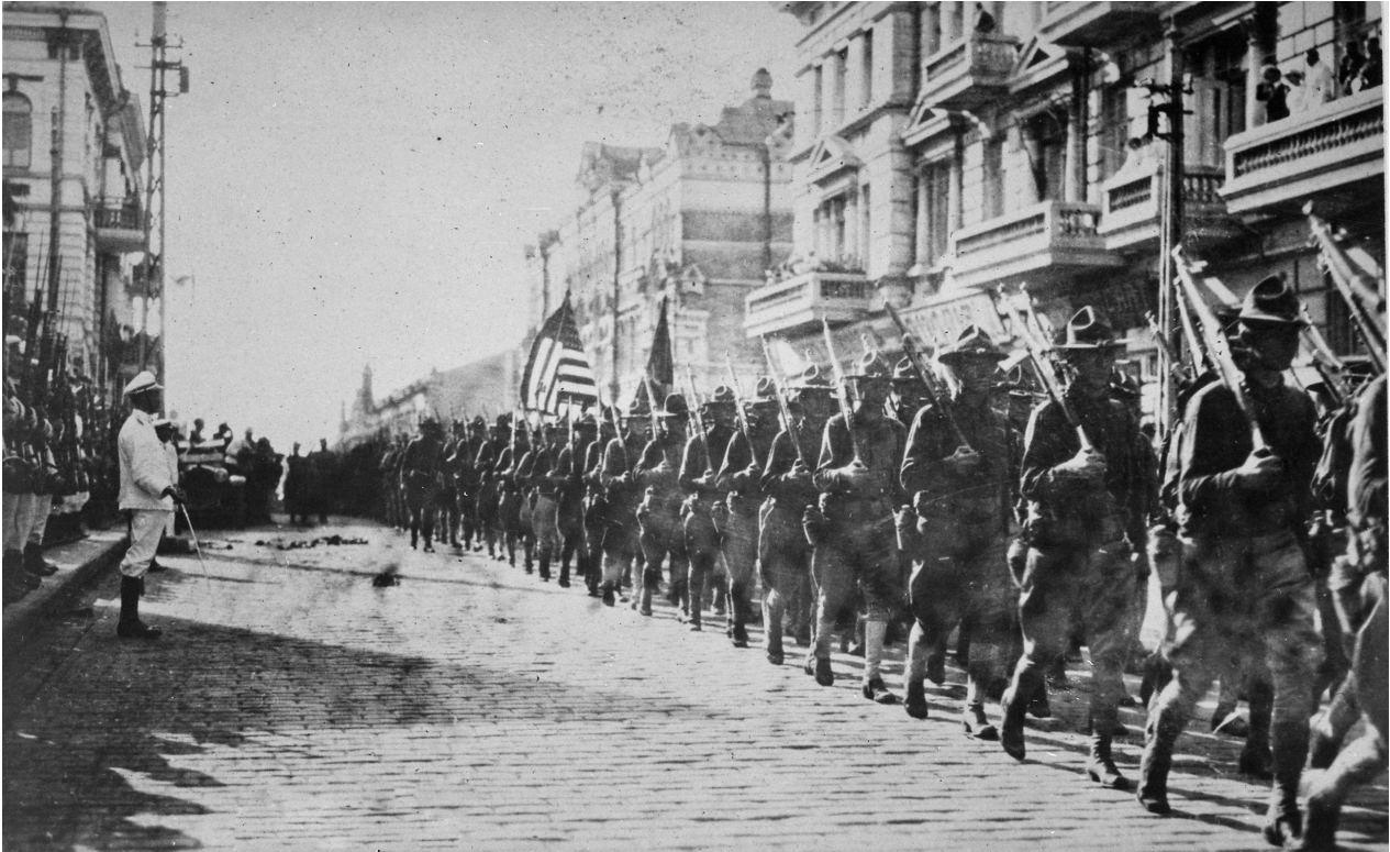
US Occupation Troops in Vladivostok 1918

DV: What are the nuclear capabilities of the U.S.'s main rivals today?