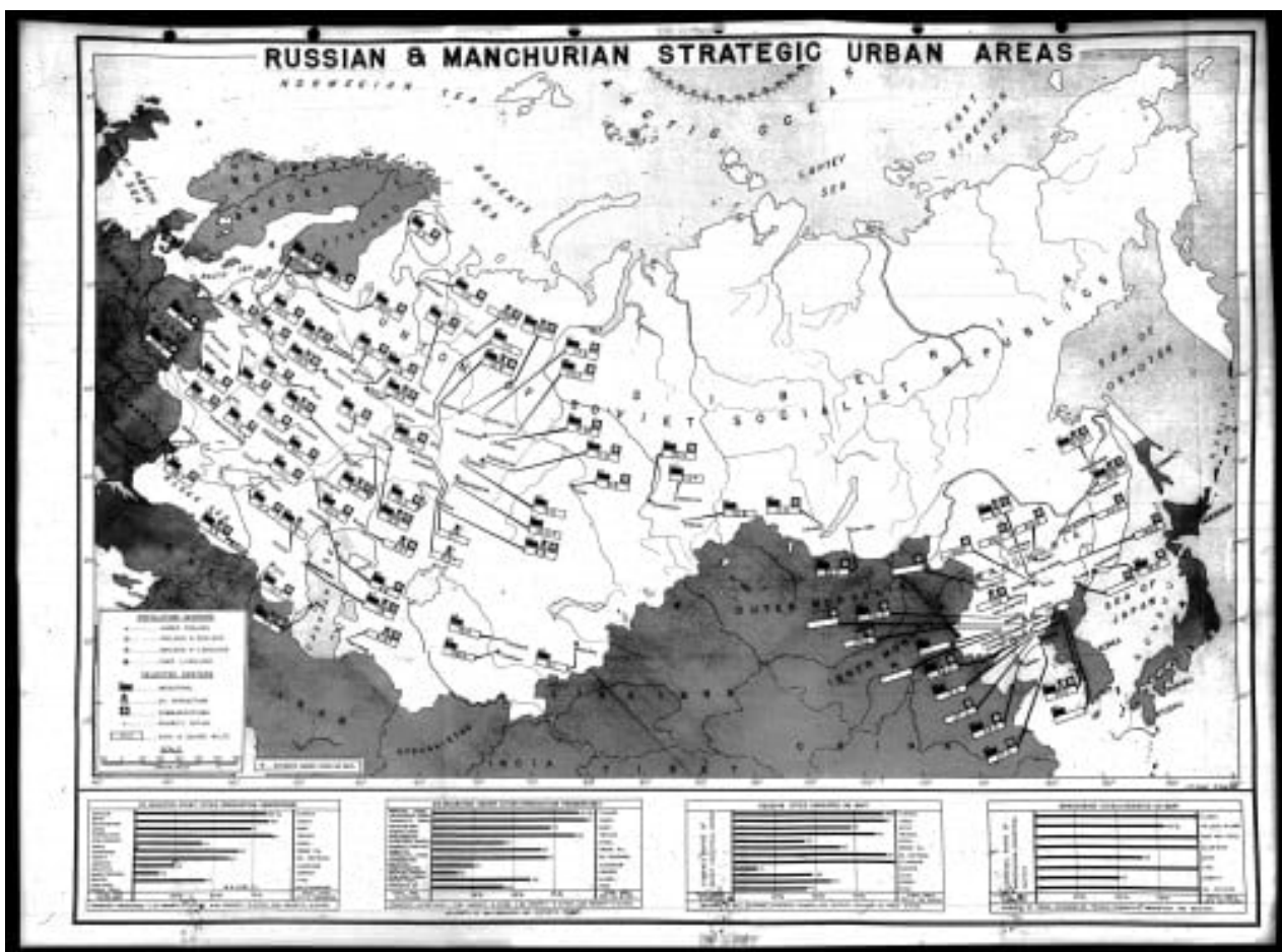
Map of 66 Soviet Urban Strategic Areas to be Bombed with 206 atomic Bombs (Declassified September 1945)

Soviet Cities to be targeted with Atomic Bombs