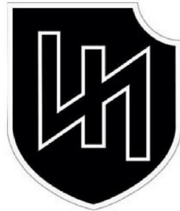
Emblem of the SS Division Das Reich.