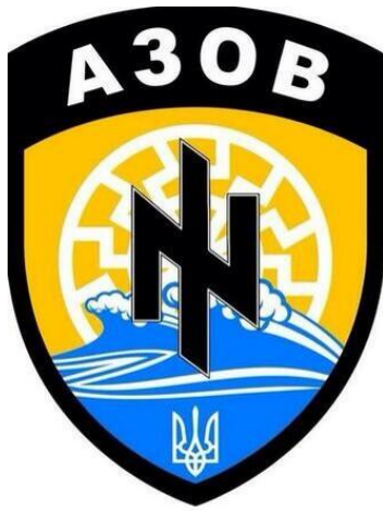
Emblem of the Azov Battalion formed by Kiev's junta.