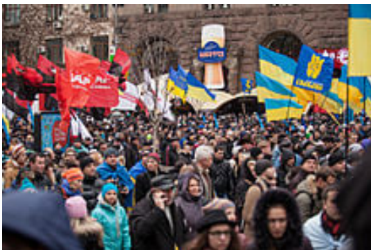
Image: Euromaidan in Kyiv, December 2013. Protesters with OUN-B flag. (Licensed under CC BY 2.0)

The Euromaidan Coup d'Etat of 2014 in Ukraine was supported by the US as first step to trigger a crisis in commodity trade and dislocation of all sectors of economic activity impoverishing Ukraine.