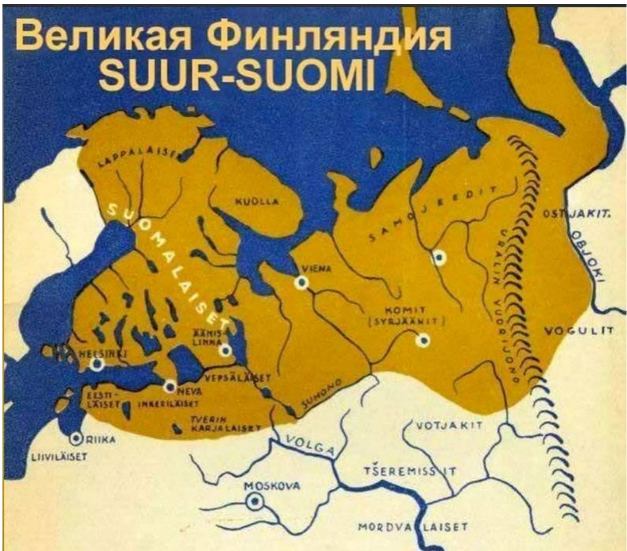
A World War 2 era map showcasing the most radical version of 'Greater Finland' ideology that saw

In the aborted Russia-Finnish Mutual Security Treaty, Russia offered to cede South Karelia in the north in exchange for the Soviet border moving westward on the Karelian Isthmus and permission to station Russian bases in Finland. The pro-German government of Ryti and Mannerheim had publicly been cozying up to the Germans during the 1930s and much of Finland's aristocracy had entertained delusional visions of expansionism along with their Swedish pro-Nazi counterparts believing that a major part of northwestern Russia called East Karelia apparently contained a "pure" Nordic people untainted by both Slavic and Scandinavian blood.