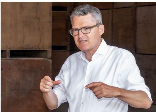
Image: Former German Colonel Roderich Kiesewetter (Licensed under CC BY-SA 4.0)