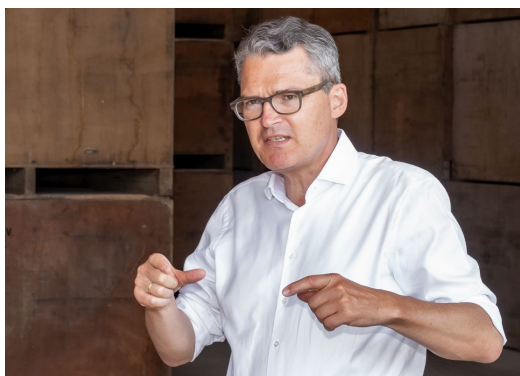
Image: Former German Colonel Roderich Kiesewetter (Licensed under CC BY-SA 4.0)