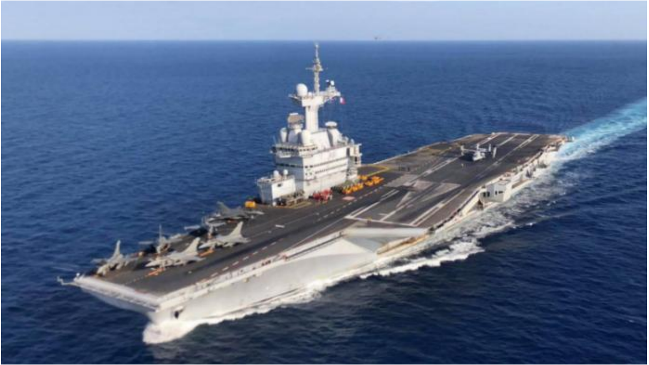
French aircraft carrier Charles de Gaulle, from which NATO preemptive strike was to be carried out.

According to Slavisha Batko Milacic writing in Global Village Space , the POLARIS 21 exercise became for the Russian Federation a signal of the real preparation of NATO for the start of hostilities against it—as happened when a full-scale U.S.-NATO military operation to affect regime change in Libya (Operation Odyssey Dawn) followed two NATO air-sea exercises (Baltops-2010 and Frisian Flag-2010).