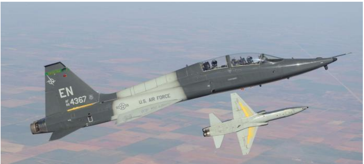
U.S. Air Force jet participating in Frisian Flag exercise prior to the launching of Operation Odyssey Dawn over Libya.

According to Slavisha Batko Milacic writing in Global Village Space , the POLARIS 21 exercise became for the Russian Federation a signal of the real preparation of NATO for the start of hostilities against it—as happened when a full-scale U.S.-NATO military operation to affect regime change in Libya (Operation Odyssey Dawn) followed two NATO air-sea exercises (Baltops-2010 and Frisian Flag-2010).