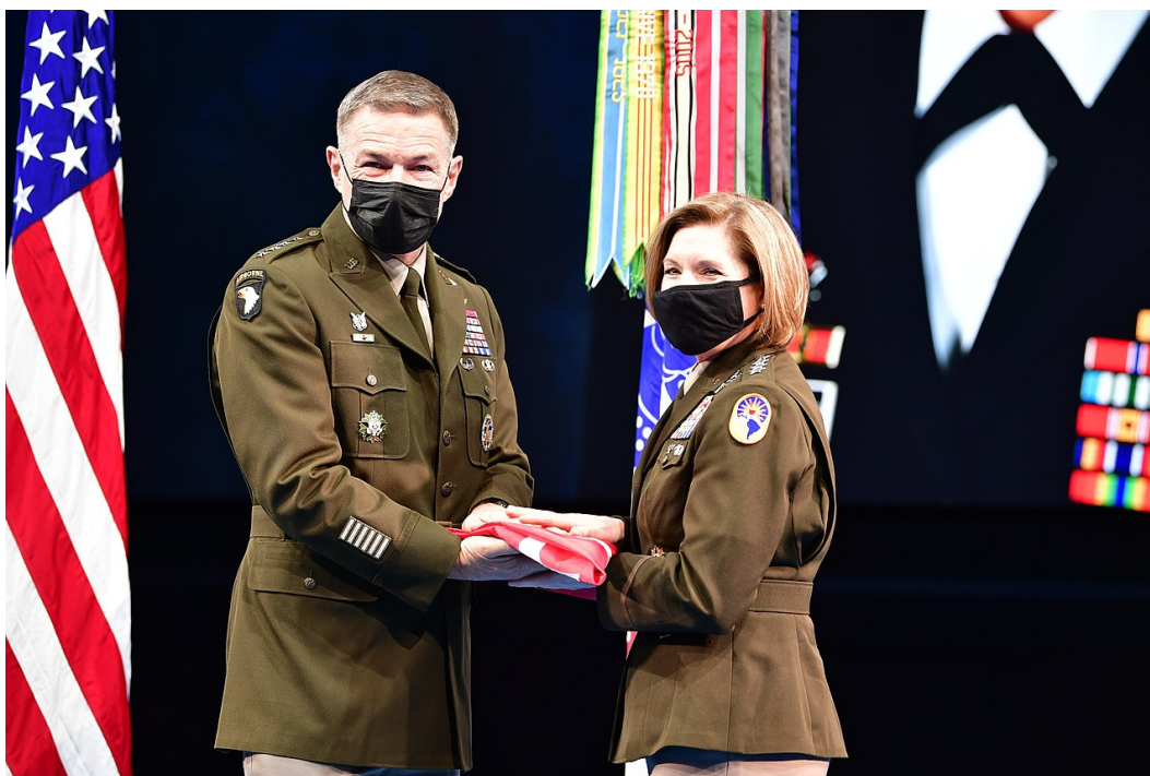
Richardson is presented her four-star flag by Army chief of staff General James C. McConville at her promotion ceremony, October 18, 2021 (Licensed under the Public Domain)

According to a report of the US Department of Defense quoted by the Venezuelan portal Misión Verdad, since May 2022 the United Kingdom is forming a “strategic triangle of control” of the southern tip of South America. While south of the Malvinas, nuclear submarines are operating. In addition, “France and the United States regularly organize joint military maneuvers in the region”.