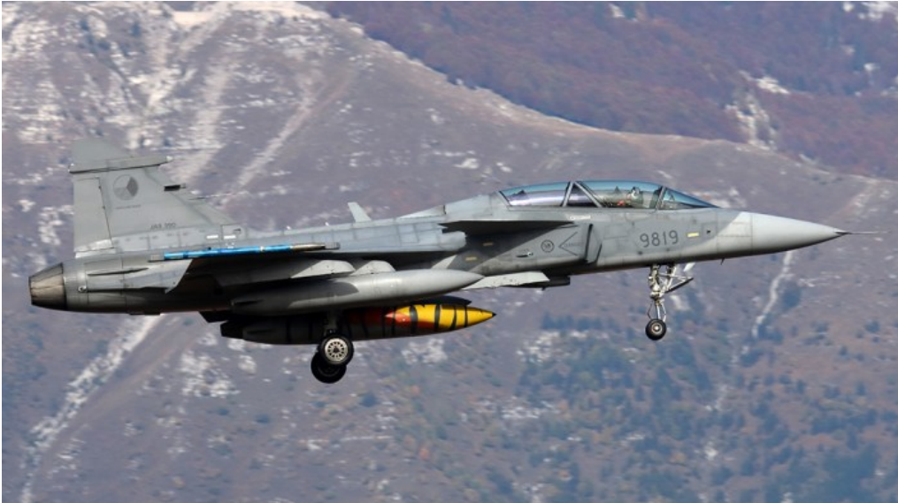
Czech Air Force JAS 39 Gripen

For what concerns the non-nuclear and support assets, the 2021 iteration of Steadfast Noon/X-Servicing drills see the participation of five Czech Air Force JAS 39 Gripens and three Polish Air Force F-16s, along with NATO E-3A AWACS and Italian Air Force G550 CAEW (Conformal Airborne Early Warning).