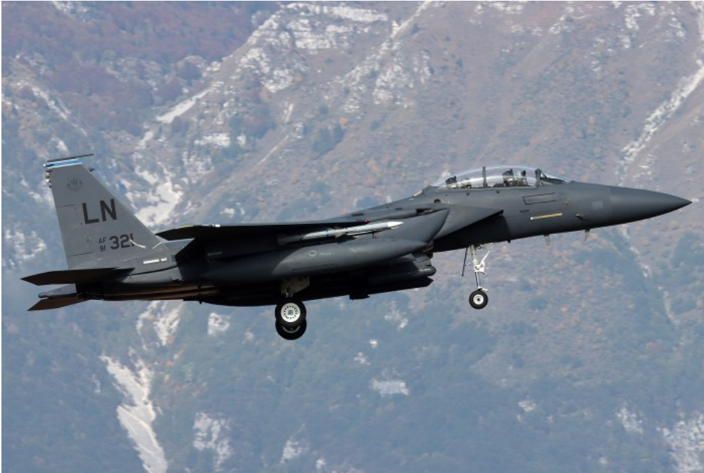
48th FW F-15E Strike Eagle

Since they are sort of back-to-back exercises, both X-Servicing and Steadfast Noon involve the same aircraft on the same bases: the missions are flown by DCA (Dual Capable Aircraft) – aircraft from Belgium, Germany, Italy, the Netherlands, Turkey and the U.S. that are able to perform either conventional or theater nuclear missions carrying the B61 bomb – along with non-nuclear aircraft that support the mission under the SNOWCAT (Support of Nuclear Operations With Conventional Air Tactics) program, which is used to enable military assets from non-nuclear countries to support the nuclear strike mission without being formally part of it.