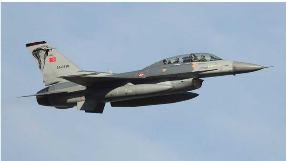
Turkish Air Force F-16.St

In particular, the Belgian, Turkish and Polish F-16s, along with the Czech Gripens and U.S. F-15E are deployed to Aviano AB, while Ghedi AB, home of the Italian Tornado fleet, hosts the Dutch F-16s and German Tornados.