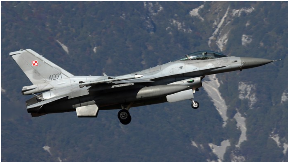
Polish Air Force F-16 landing at Aviano on Oct. 18, 2021

Even though, NATO is usually quite tight-lipped when it deals with this kind of exercise, you can get an idea of the flying activity thanks to some OSINT: flight tracking websites show some of the assets taking part in the drills as they operate inside the restricted airspaces announced by relevant NOTAMs (Notice To Airmen). Then, you can also get some interesting photographs to cross correlate the rest of the information, thanks to the aircraft spotters taking shots outside the main operating bases.