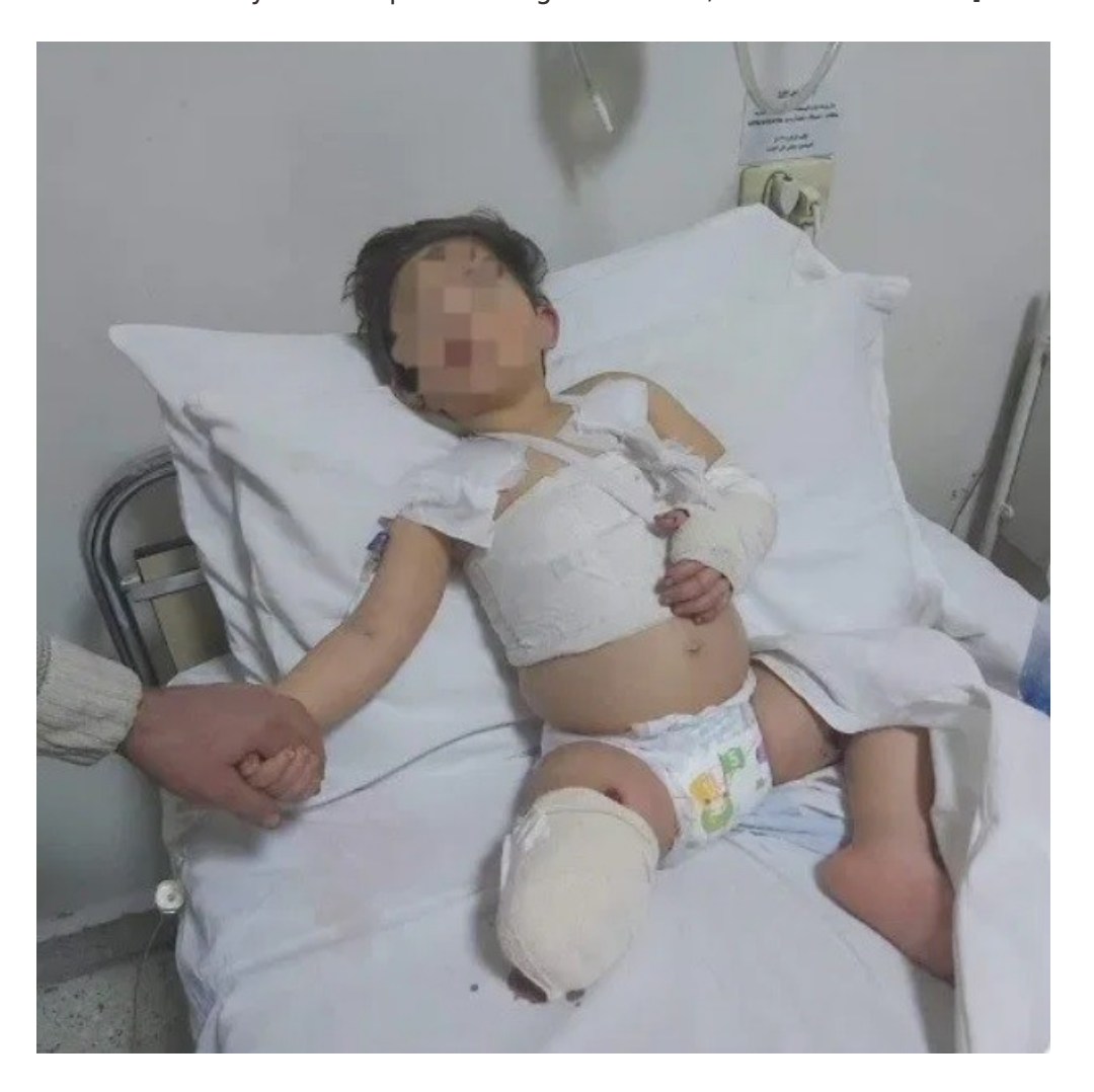
NATO allies did not call for an emergency meeting when terrorists bombed another Aleppo neighborhood.

She called for Syria to stop defending its citizens, via an immediate [unilateral] CoH.