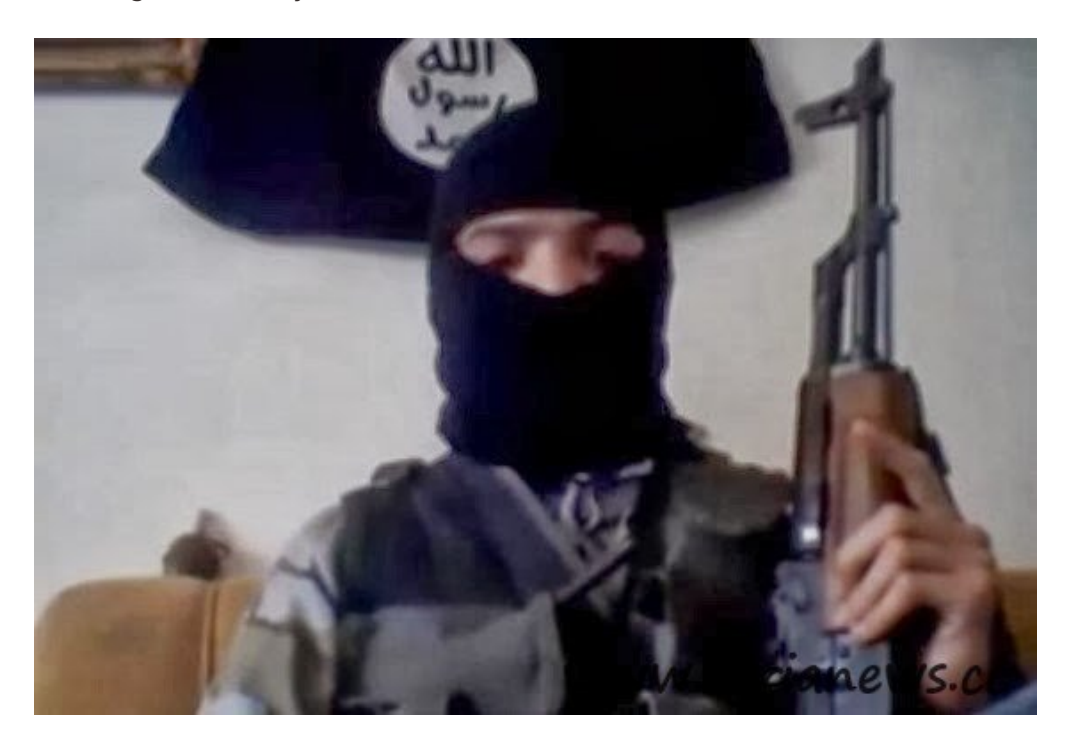
A Belgian Jihadist in the ranks of the FSA, the Free FROM Syrians Army

He also pretended that nobody knew that Belgian special operatives continue to illegally be on the ground, in Syria.