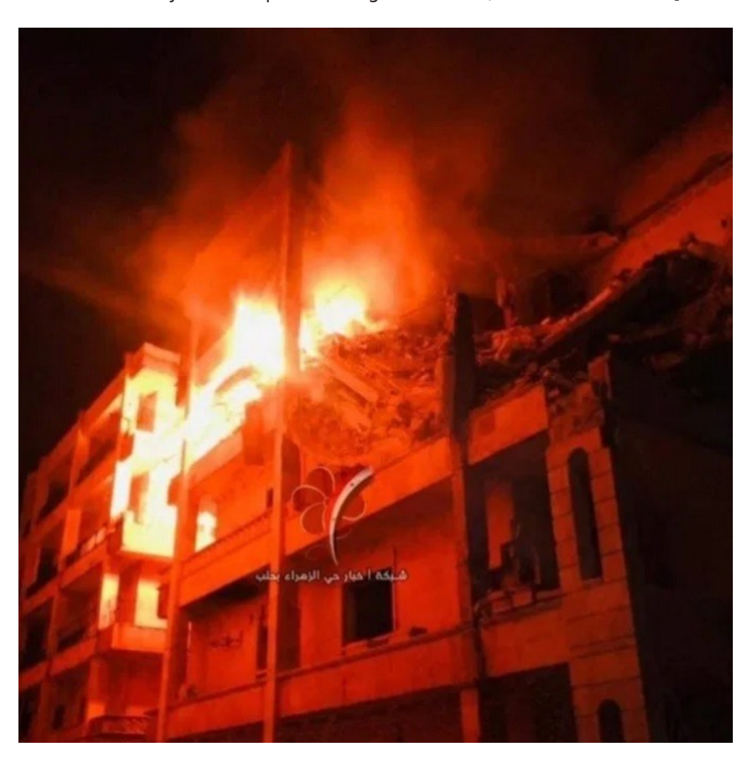
NATO allies in the UN did not call an emergency meeting when terrorists bombed this apartment

She called for Syria to stop defending its citizens, via an immediate [unilateral] CoH.