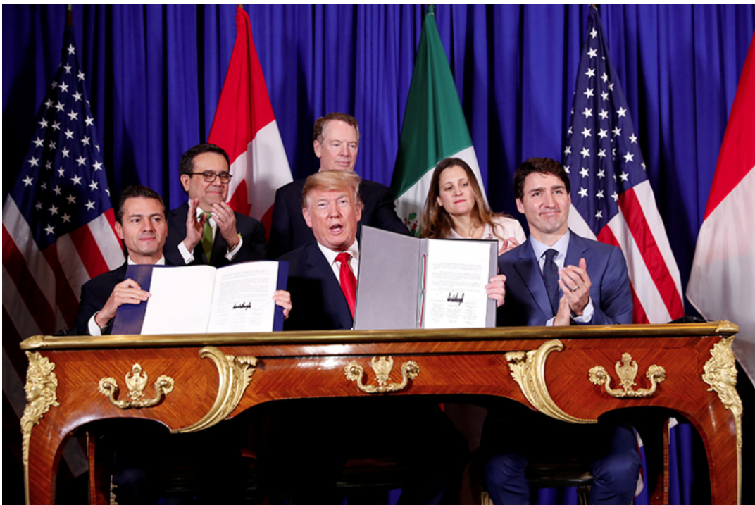
US President Donald J. Trump (center), Canadian Prime Minister Justin Trudeau (right), and Mexican President Enrique Peña Nieto signed the USMCA trade agreement before the start of the G20 Leaders’ Summit in Buenos Aires, Argentina, on November 30. They were accompanied by (back from left) Mexican Economy Minister Ildefonso Guajardo, US Trade Representative Robert Lighthizer, and Canadian Foreign Minister Chrystia Freeland.

On November 30, 2018, US President Donald Trump, Canada’s Prime Minister Justin Trudeau, and Mexico’s President Enrique Peña Nieto signed USMCA or NAFTA 2.0.