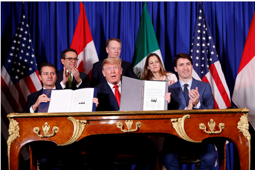
US President Donald J. Trump (center), Canadian Prime Minister Justin Trudeau (right), and Mexican President Enrique Peña Nieto signed the USMCA trade agreement before the start of the G20 Leaders’ Summit in Buenos Aires, Argentina, on November 30. They were accompanied by (back from left) Mexican Economy Minister Ildefonso Guajardo, US Trade Representative Robert Lighthizer, and Canadian Foreign Minister Chrystia Freeland.

On November 30, 2018, US President Donald Trump, Canada’s Prime Minister Justin Trudeau, and Mexico’s President Enrique Peña Nieto signed USMCA or NAFTA 2.0.