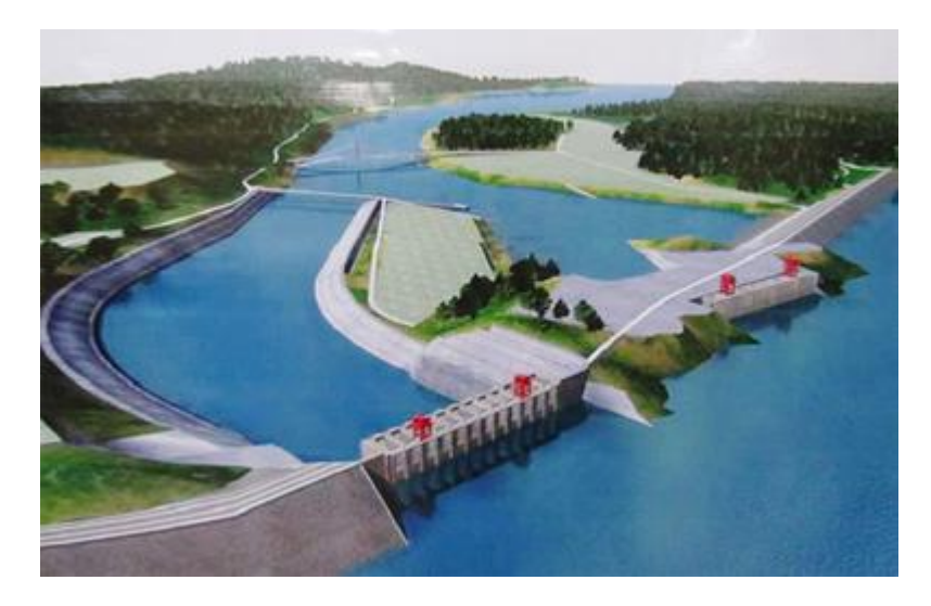
Image: <u>The Myitsone Dam</u>, on its way to being the 15th largest in the world until construction was halted in September by a campaign led by <u>Wall Street-puppet Aung San Suu Kyi</u>, a stable of US-funded NGOs, <u>and a terrorist campaign</u> executed by armed groups operating in Kachin State, Myanmar.

In "Myanmar (Burma) "Pro-Democracy" Movement a Creation of Wall Street & London," it was documented that Suu Kyi and organizations supporting her, including local propaganda fronts like the New Era Journal, the Irrawaddy, and the Democratic Voice of Burma (DVB) radio, have received millions of dollars a year from the Neo-Conservative chaired National Endowment for Democracy, convicted criminal and Wall Street speculator George Soros' Open Society Institute, and the US State Department itself, citing Britain's own "Burma Campaign UK (.pdf)."