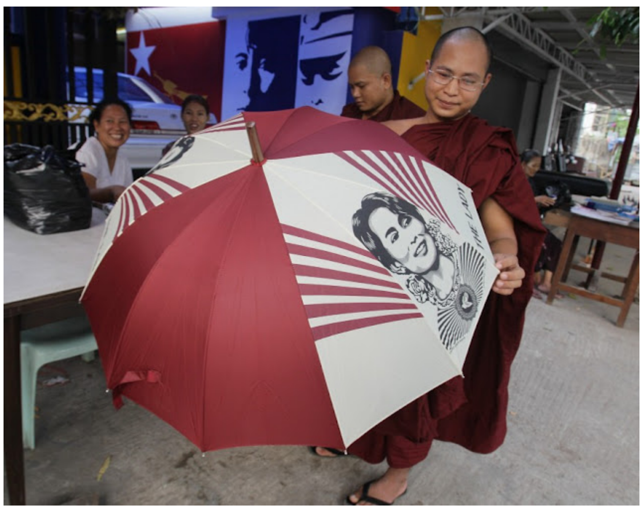
Image : An alleged monk, carries an umbrella with Aung San Suu Kyi's image on it. These so-called monks have played a central role in building Suu Kyi's political machine, as well as maintaining over a decade of genocidal, sectarian violence aimed at Myanmar's ethnic minorities. Another example of US "democracy promotion" and tax dollars at work.

While Western news agencies have attempted to spin the recent violence as a new phenomenon implicating Aung San Suu Kyi's political foot soldiers as genocidal bigots, in reality, the sectarian nature of her support base has been back page news for years. AFP's recent but uncharacteristically honest portrayal of Wirathu, with an attempt to conceal his identity and role in Aung San Suu Kyi's "Saffron" political machine, illustrates the quandary now faced by Western propagandists as the violence flares up again, this time in front of a better informed public.