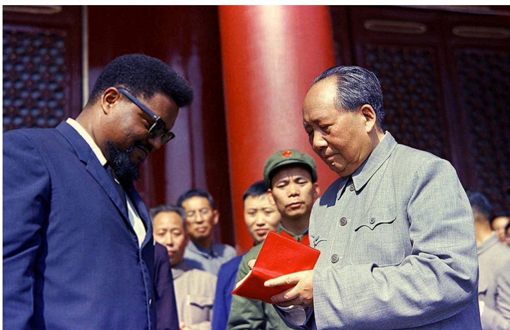
Chinese Leader Chairman Mao with African American Freedom Fighter Robert F. Williams

The disbursements of these funds include five billion of direct and along with interest free loans. Another 35 billion is allocated for what are described as preferential loans and export credit on favorable terms. An additional five billion in capital is slated to replenish the China-Africa development fund. Five billion more in initial capital will go for special loans to small and medium-sized enterprises each. Finally, ten billion was allocated to enhance the China-Africa production capacity cooperation fund. (AU.int, Aug. 2, 2016)