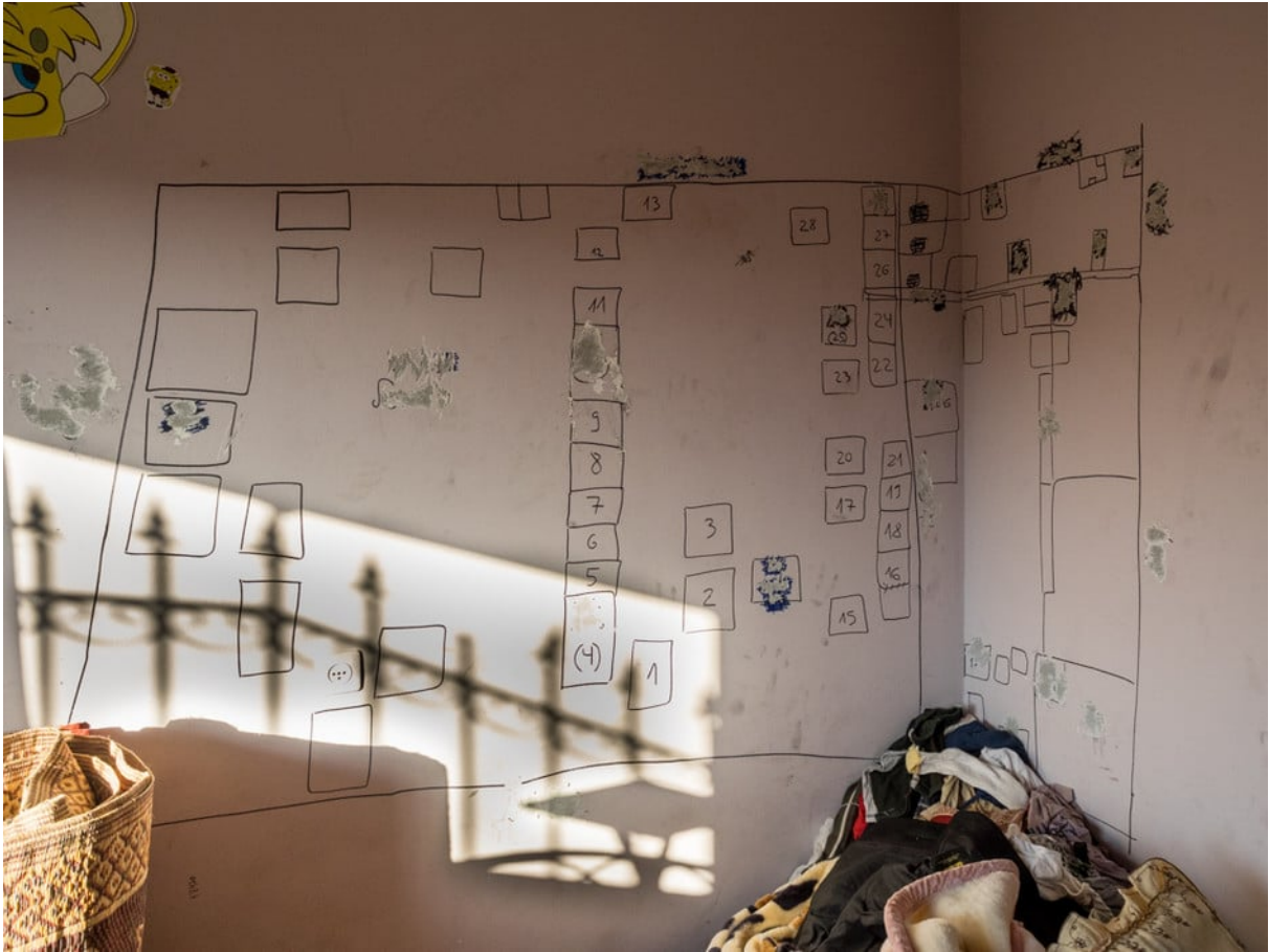
In a child’s bedroom in Shujaiya, a map depicts the homes in the immediate vicinity. Many of the numbered homes were destroyed.

Next to a map of the surrounding area in Shujaiya, the Hebrew-language graffiti reads (from top to bottom): “Values, Toughness, Mutuality, Striving for contact” and “Understanding the forces.”