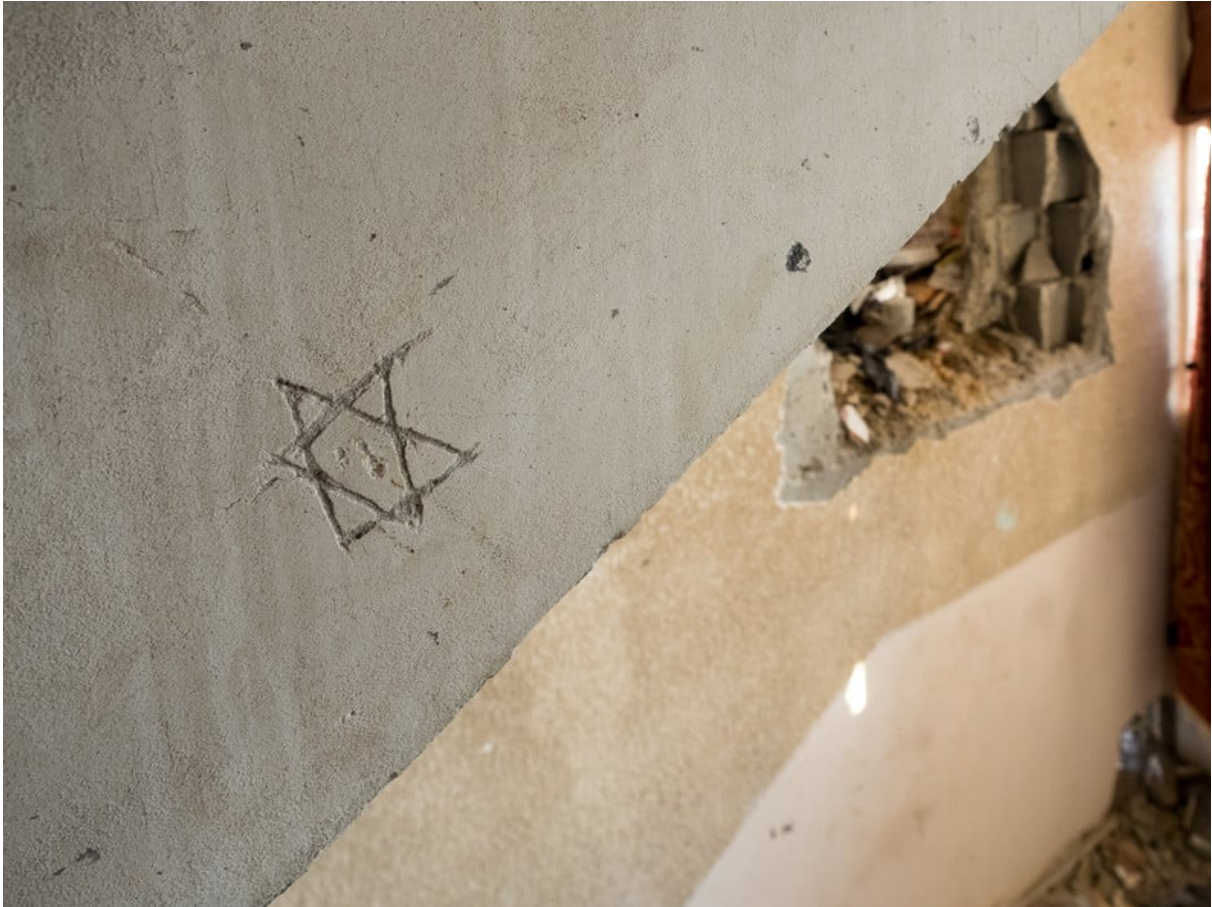
A Star of David etched into the staircase of a home in Shujaiya.