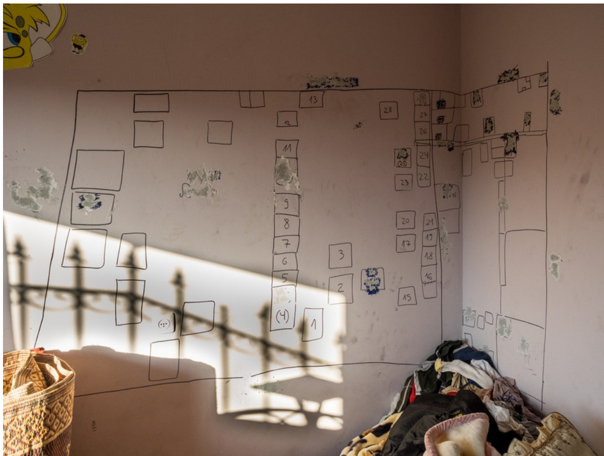
In a child's bedroom in Shujaiya, a map depicts the homes in the immediate vicinity. Many of the numbered homes were destroyed.

Next to a map of the surrounding area in Shujaiya, the Hebrew-language graffiti reads (from top to bottom): “Values, Toughness, Mutuality, Striving for contact” and “Understanding the forces.”