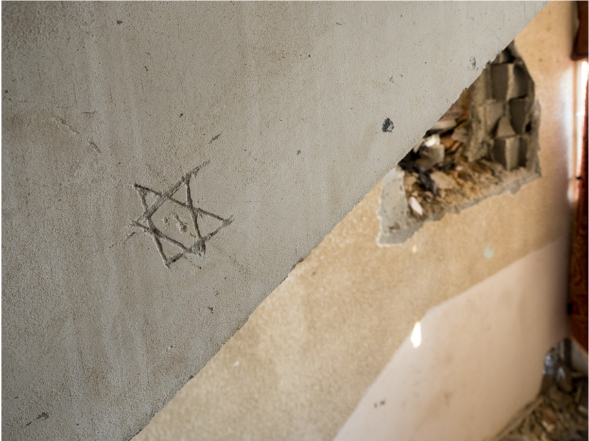
A Star of David etched into the staircase of a home in Shujaiya.