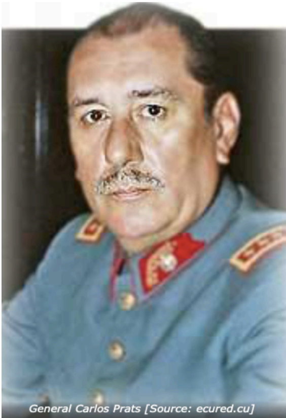
General Carlos Prats