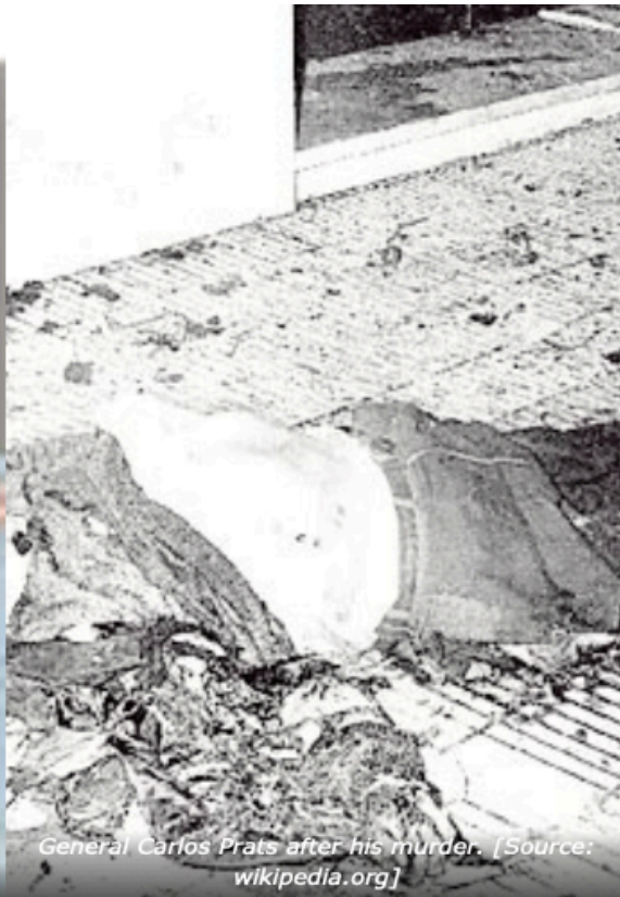
General Carlos Prats after his murder.

Letelier was the next target because he had been a) effective in cultivating alliance with Democratic Party senators and in lobbying for the cut-off of U.S. military aid to Chile; b) had helped initiate a Dutch embargo of Chilean products; c) had denounced Pinochet's atrocities at a large rally in Madison Square Garden; and d) was working to develop plans for a new world economy that would undercut the power of large corporations.