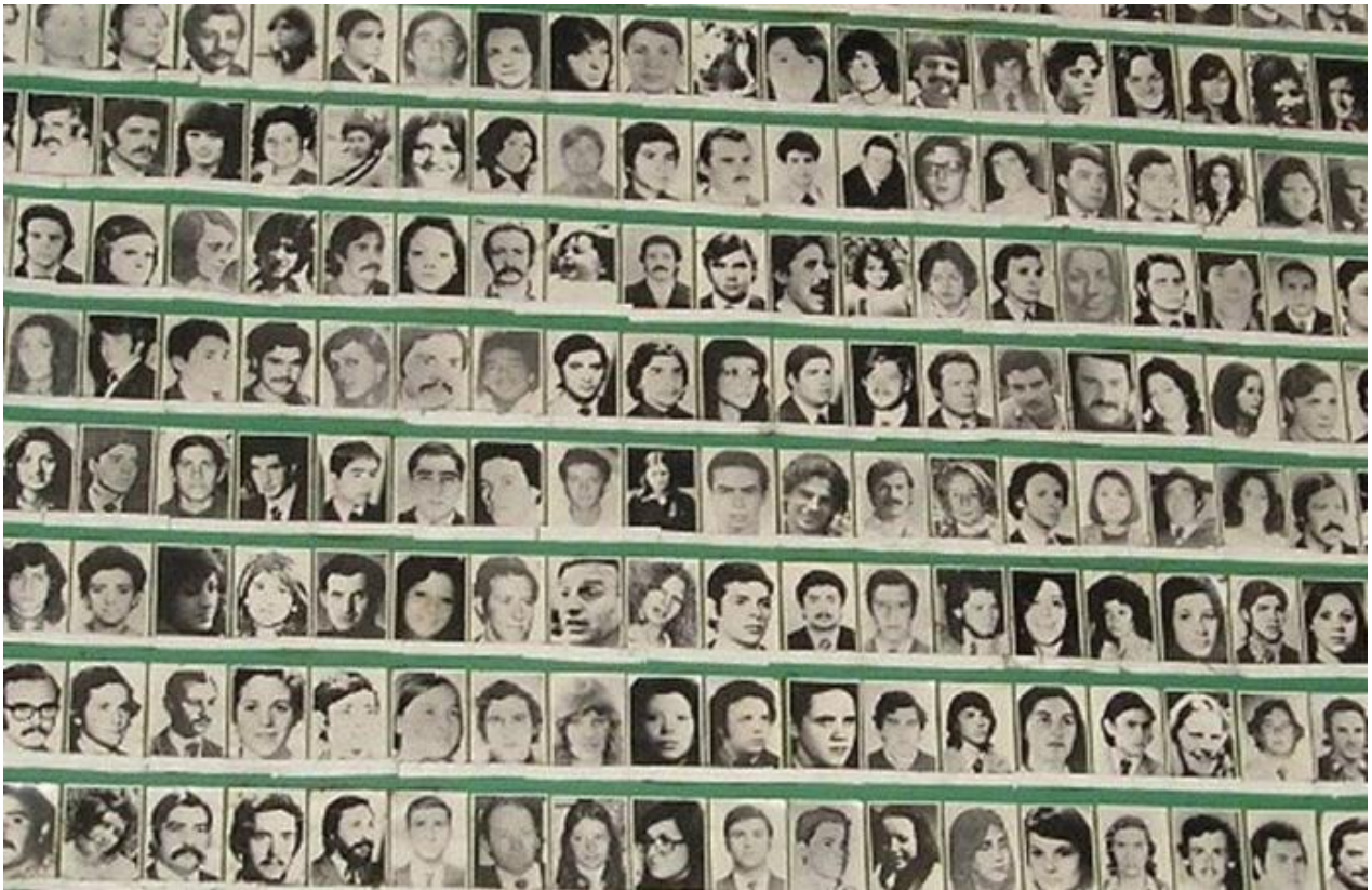
Victims of Operation Condor.

coordinated their efforts to hunt down left-wing dissidents, including civilian politicians.