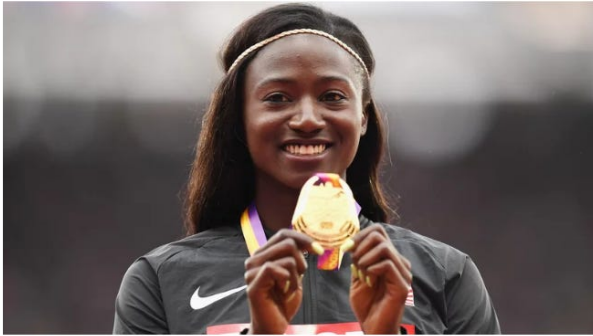
Tori Bowie, who captured gold as a sprinter in the Olympics and the world championships, died at age 32 from complications of childbirth, according to an autopsy report.