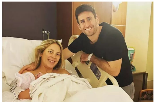
A Pennsylvania woman who died shortly after giving birth is being remembered for her passion as both a mom and a teacher.