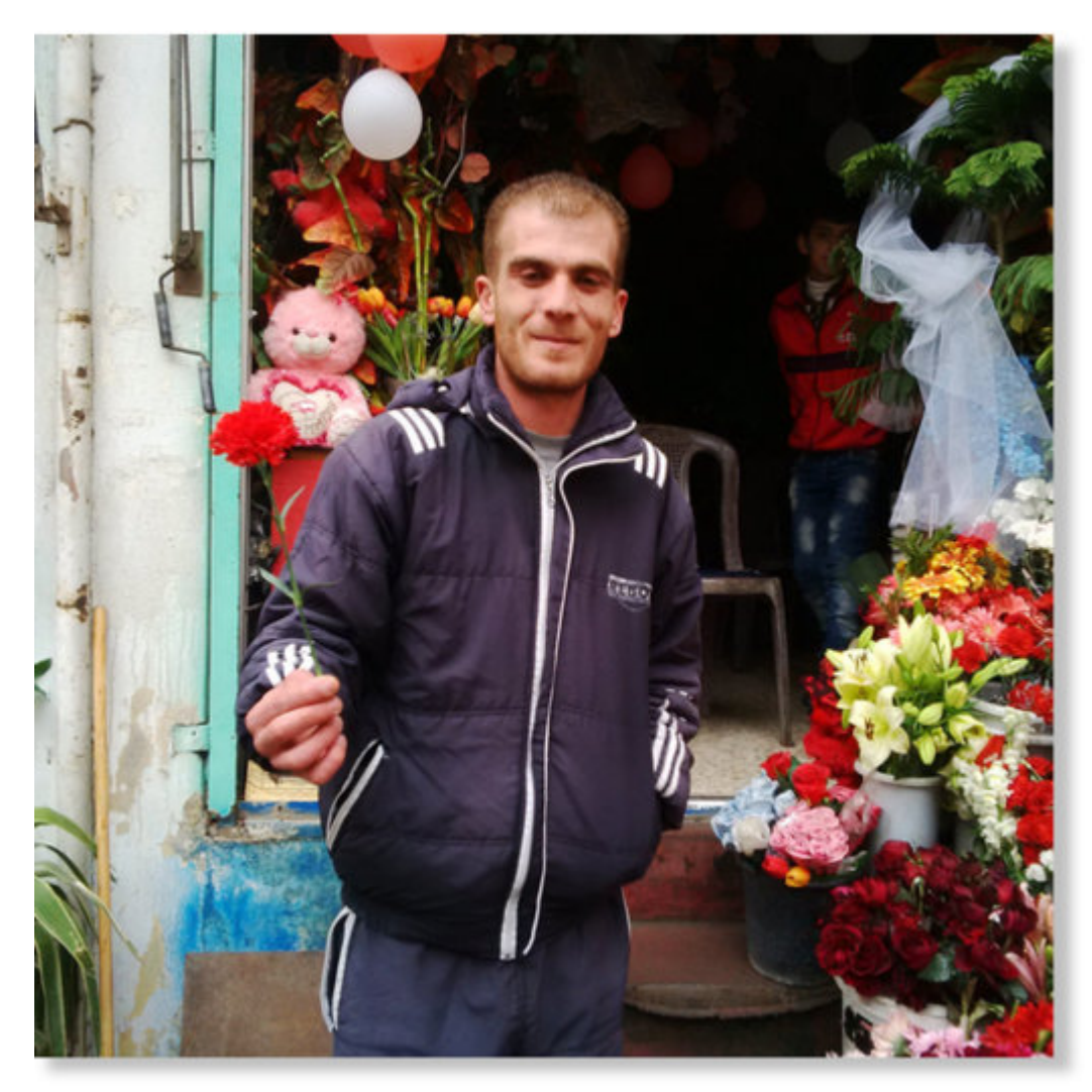
A flower vendor in Sweida

The al-Waer district of Homs in December 2015 saw a deal in which a few hundred of the armed militants and their families were shuttled to Idlib and surrounding areas. Another 2,200 primarily anti-government mercenaries remain within the residential area of al-Waer. The government continues to supply residents with food, medicine, electricity (free) and water (free) and has a bread factory at the last checkpoint before entering al-Waer, which I visited in December 2015. The factory receives wheat from the government and supplies the residents within with bread (in spite of the presence of the anti-government militants). While observing Syrians walking towards the checkpoint to the terrorist-held area, I was cautioned by security to step back: there is a ceasefire, but the militants within could violate that at any time.