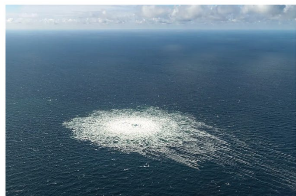
A leak from Nord Stream 2 is seen on Sept. 28.

I put together a map detailing the route that would be required for Ukraine's navy to sail from the war-torn Port of Odesa to the areas where the Nord Stream pipeline was sabotaged. The roundtrip journey amounts to about ten thousand miles, which would be impossible to pull off undetected.