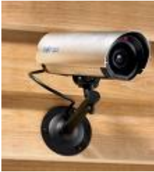
Britain: CCTV Surveillance into Thousands of British Homes - 2009-07-31