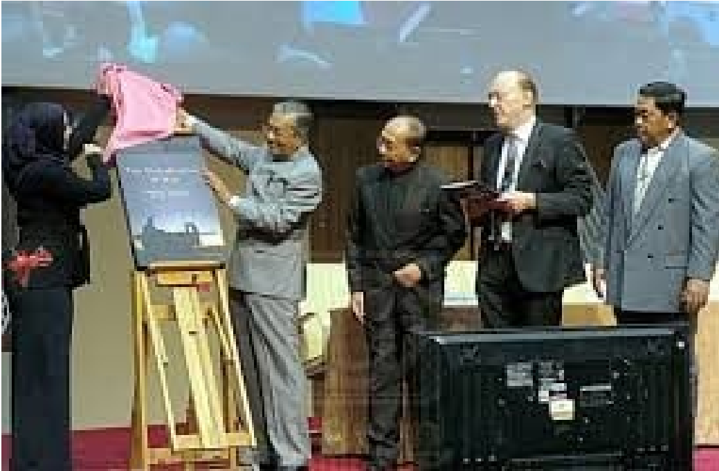
The 2015 Kuala Lumpur launching by Tun Dr. Mahathir Mohamad, Former PM of Malaysia of Michel Chossudovsky's book entitled The Globalization of War