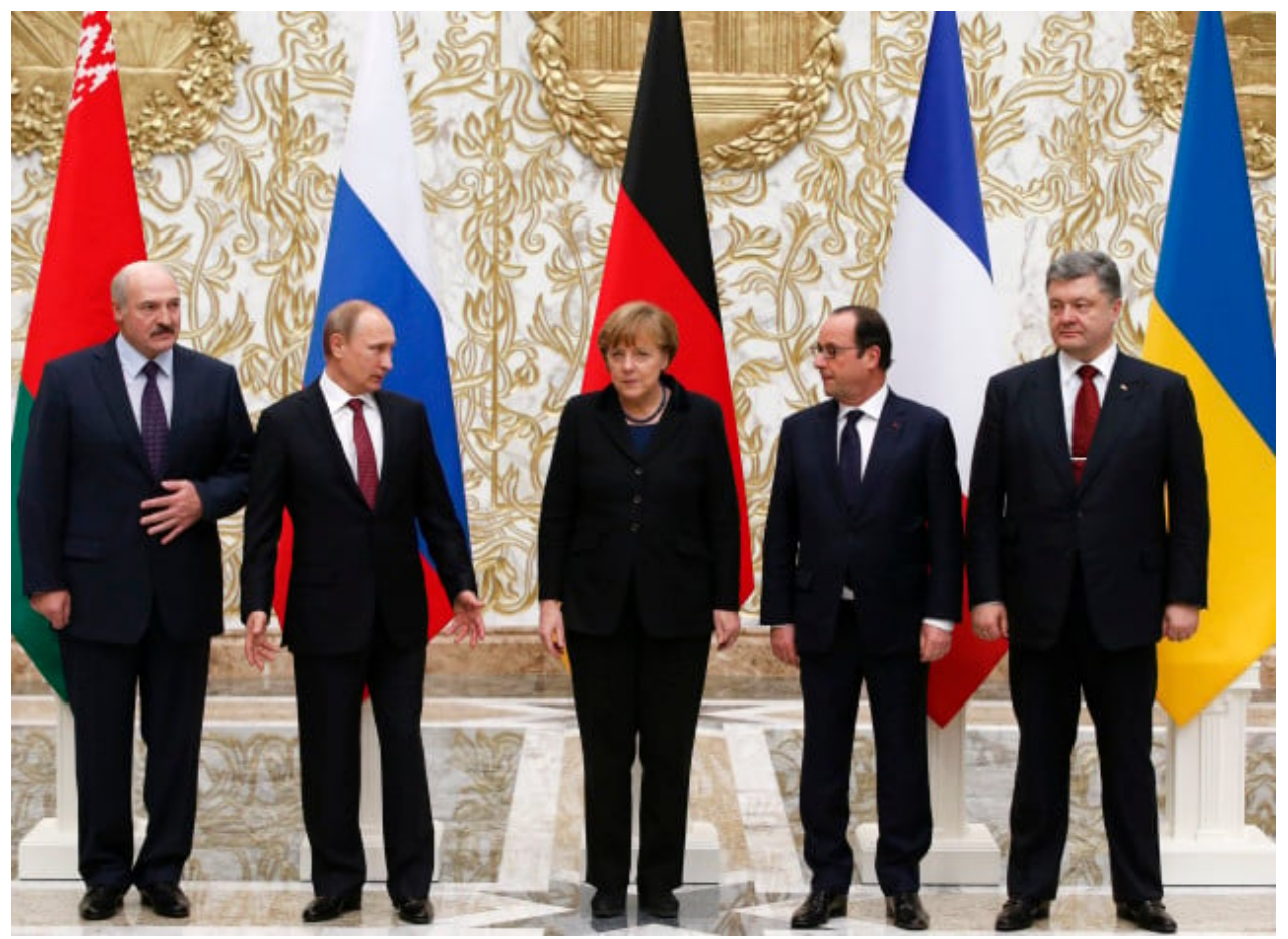
February 2015, Minsk 2 Agreement

In addition, after months of lies and denials, the US Department of Defense finally admitted having funded and built 46 military-grade (grade 3) bio-labs in Ukraine. See <u>this</u>.