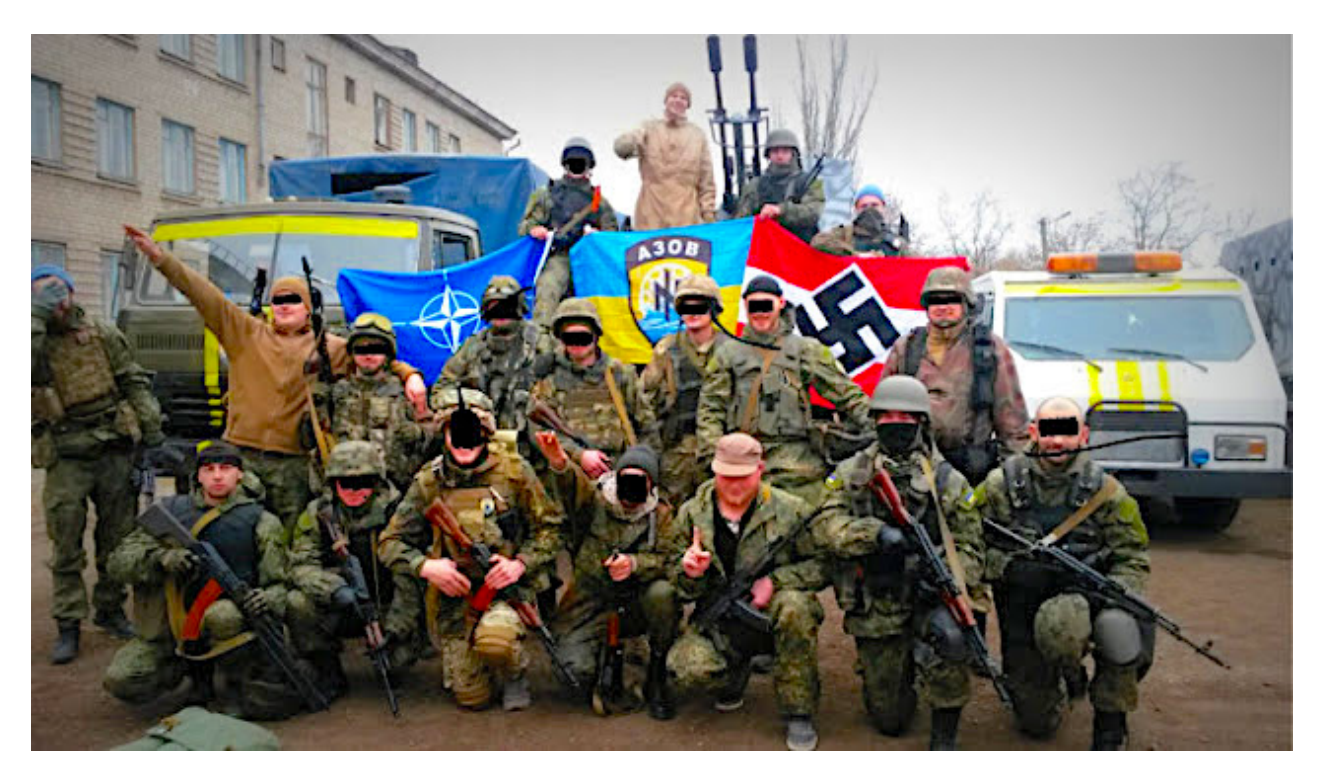
Azov Battalion members.

So, for nearly a year and a half, the West's mainstream media, especially The New York Times and The Washington Post , twisted their reporting into all kinds of contortions to avoid telling their readers that the new regime in Kiev was permeated by and dependent on neo-Nazi fighters and Ukrainian ultra-nationalists who wanted a pure-blood Ukraine, without ethnic Russians.