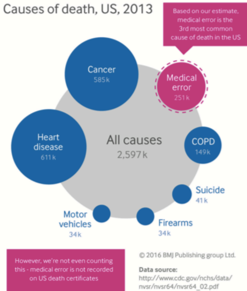
Fig 1 Most common causes of death in the United States, 2013 2

that medical error is the third most common cause of death in the US (fig 1).[2]