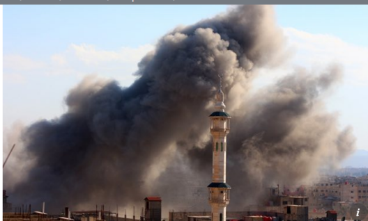
Russian airstrikes in Syria killed 2,000 civilians in six months

These tricks are employed even more frequently, and egregiously, in reports on atrocities committed by the US and its allies. And while media outlets invariably give the US the benefit of the doubt, Western enemies are not afforded the same luxury.