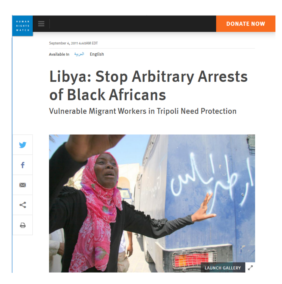
Human Rights Watch (9/4/11) documented racist persecution in post-Qadhafi Libya.

Human Rights Watch's longtime executive director <u>Kenneth Roth</u> cheered on NATO intervention in Libya in 2011, calling the UN Security Council's unanimous endorsement of a no-fly zone a "remarkable" confirmation of the so-called "responsibility to protect" doctrine.