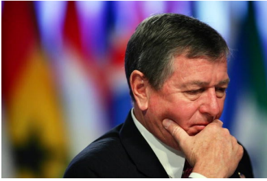
Attorney General John Ashcroft

In what would become one of the most famous moments of the Bush Administration, presidential aides Andrew Card and Alberto Gonzales show up at the hospital bed of John Ashcroft. Their purpose? To convince the seriously ill attorney general to sign off on the extension of a secret domestic spying program. Ashcroft refuses, believing the warrantless program to be illegal.