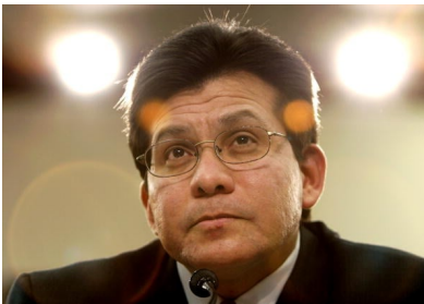
Attorney General Alberto Gonzalez

Attorney General Alberto Gonzales announces that the FISA court has allowed the government to target international communications that start or end in the U.S., as long as one person is “a member or agent of al Qaeda or an associated terrorist organization.” Gonzalez says the government is ending the “terrorist surveillance program,” and bringing such cases under FISA approval.