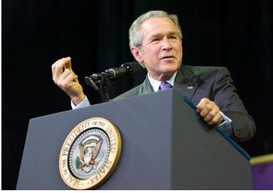
President Bush speaks at Kansas State University.

President Bush defends what he calls the “terrorist surveillance program” in a speech in Kansas. He says the program only looks at calls in which one end of the communication is overseas.