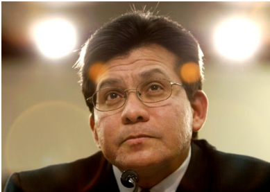
Attorney General Alberto Gonzalez

Attorney General Alberto Gonzales announces that the FISA court has allowed the government to target international communications that start or end in the U.S., as long as one person is “a member or agent of al Qaeda or an associated terrorist organization.” Gonzalez says the government is ending the “terrorist surveillance program,” and bringing such cases under FISA approval.