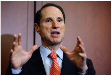
U.S. Sen. Ron Wyden (D-Ore.)

In a letter to the attorney general, Sens. Ron Wyden, D-Ore., and Mark Udall, D-Colo., write, “We believe most Americans would be stunned to learn the details” of how the government has interpreted Section 215 of the Patriot Act. Because the program is classified, the senators offer no further details.