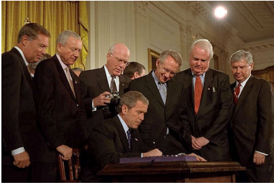
President George W. Bush signs the Patriot Act.

In the wake of 9/11, Congress passes the sweeping USA Patriot Act. One provision , section 215, allows the FBI to ask the FISA court to compel the sharing of books, business documents, tax records, library check-out lists – actually, “any tangible thing” – as part of a foreign intelligence or international terrorism investigation. The required material can include purely domestic records.