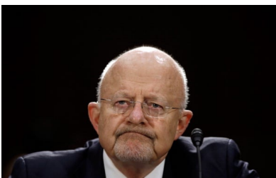
Director of National Intelligence James Clapper

Following the publication of the Guardian’s story about the Verizon order, Sens. Feinstein and Saxby Chambliss, R-Ga., the chair and vice of the Senate intelligence committee, hold a news conference to dismiss criticism of the order. “This is nothing particularly new,” Chambliss says. “This has been going on for seven years under the auspices of the FISA authority, and every member of the United States Senate has been advised of this.”