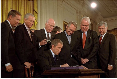
President George W. Bush signs the Patriot Act.

In the wake of 9/11, Congress passes the sweeping USA Patriot Act. One provision , section 215, allows the FBI to ask the FISA court to compel the sharing of books, business documents, tax records, library check-out lists – actually, “any tangible thing” – as part of a foreign intelligence or international terrorism investigation. The required material can include purely domestic records.