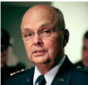
Michael Hayden, director of the NSA when the warrantless wiretapping began

The Times, over the objections of the Bush Administration, reveals that since 2002 the government “monitored the international telephone calls and international e-mail messages of hundreds, perhaps thousands, of people inside the United States without warrants.” The program involves actually listening in on phone calls and reading emails without seeking permission from the FISA Court.