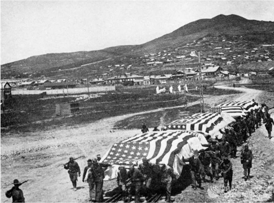
U.S. troops in Vladivostok, 1918.

Later, the United States cruelly lured the Soviets into a lengthy war in Afghanistan. And after the Soviet Union disbanded itself in 1991, the United States, contrary to promises made, ringed Russia with nations that were given membership in a collective security alliance known as the North Atlantic Treaty Organization (NATO). Several members of NATO have nuclear weapons themselves, and membership requires all members to defend any member who is attacked.