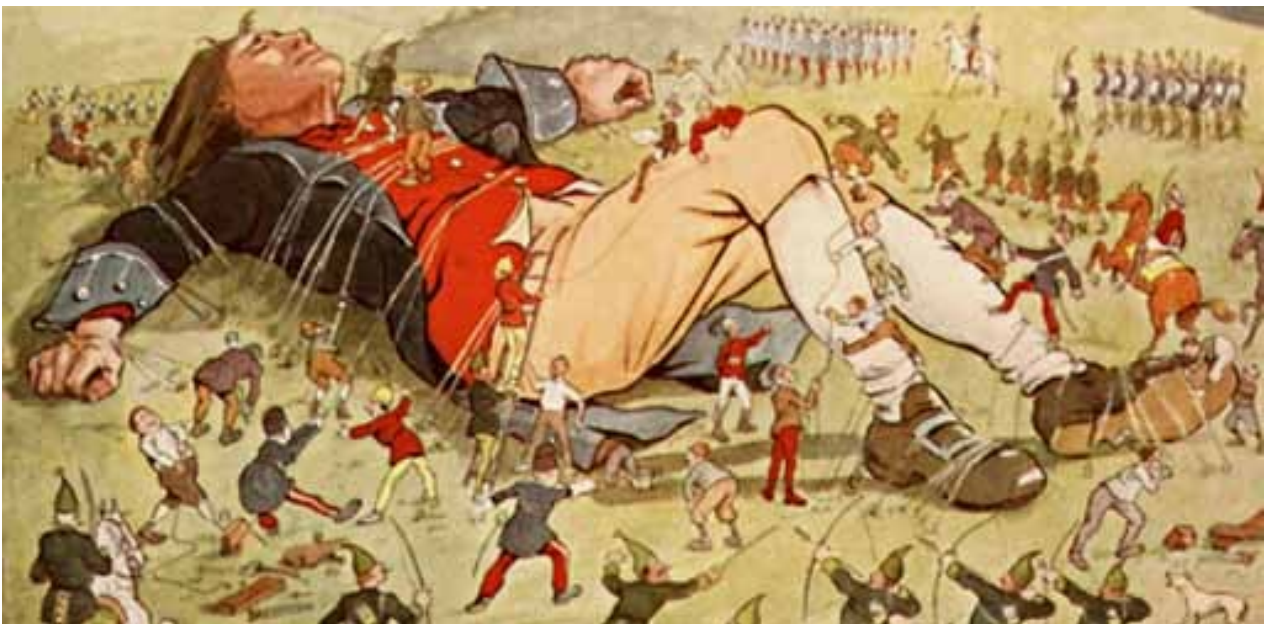
Image: Lemuel Gulliver on the island of Lilliput, having been overtaken while asleep by ropes and stakes by the diminutive but numerous Lilliputians. Western corporate-financier interests envision organizing Southeast Asia into a supranational bloc, ASEAN (Association of Southeast Asian Nations), to use the smaller nations as a combined front to "tie down" China in a similar manner. Unlike in the story "Gulliver's Travels," China may well break free of its binds and stomp the Lilliputian leaders flat for their belligerence.