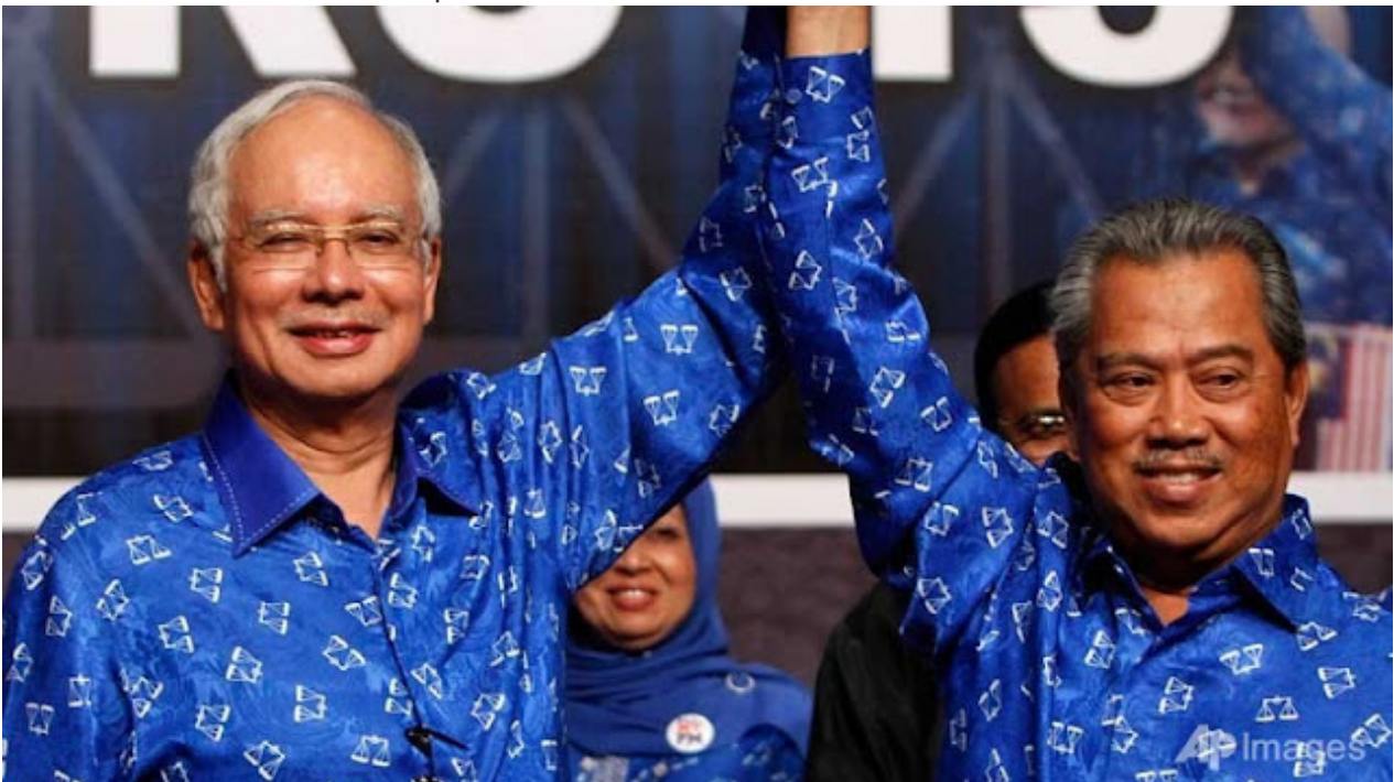
Image: Despite the US mobilizing the summation of its media power and pouring millions of dollars into the opposition party, including the creation and perpetuation of fake-NGOs such as Bersih and the Merdeka Center, Malaysian Prime Minister Najib Razak sailed to a comfortable victory in this year's general elections. The cheap veneer has begun peeling away from America's "democracy promotion" racket, leaving its proxies exposed and frantic, and America's hegemonic ambitions

Wall Street and London's hegemonic ambitions in Asia, centered around installing proxy regimes across Southeast Asia and using the supranational ASEAN bloc to encircle and contain China, suffered a serious blow this week when Western-proxy and Malaysian opposition leader Anwar Ibrahim's party lost in general elections. While Anwar Ibrahim's opposition party, Pakatan Rakyat (PR) or "People's Alliance," attempted to run on an anti-corruption platform, its campaign instead resembled verbatim attempts by the West to subvert governments politically around the world, including most recently in Venezuela, and in Russia in 2012. Just as in Russia where so-called "independent" election monitor GOLOS turned out to be fully funded by the US State Department through the National Endowment for Democracy (NED), Malaysia's so-called election monitor, the Merdeka Center for Opinion Research, is likewise funded directly by the US through NED . Despite this, Western media outlets, in pursuit of promoting the Western-backed People's Alliance, has repeatedly referred to Merdeka as "independent."