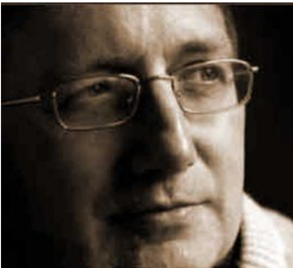
Former British Ambassador Craig Murray

Murray said he flew from London to Washington for a clandestine handoff from one of the email sources in September, receiving the package in a wooded area near American University.