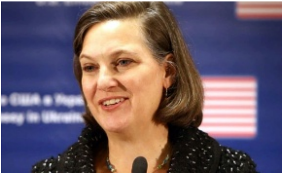
Assistant Secretary of State for European and Eurasian Affairs Victoria Nuland during a press conference at the U.S. Embassy in Kiev, Ukraine, on Feb. 7, 2014.

However, as with earlier “regime change” plans, the neocons and liberal hawks never think through the scenario to the end. They always assume that everything is going to work out fine and some well-dressed “opposition leader” who has been to their think-tank conferences will simply ascend to the top job.