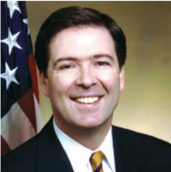
FBI Director James Comey

Rather than national party leaders taking the blame for pre-selecting a very flawed candidate and ignoring all the warning signs about the public’s resistance to this establishment choice, Democrats have pointed fingers at almost everyone else – from FBI Director James Comey for briefly reviving Clinton’s email investigation, to third-party candidates who siphoned off votes, to the archaic Electoral College which negates the fact that Clinton did win the national popular vote – and now to the Russians.