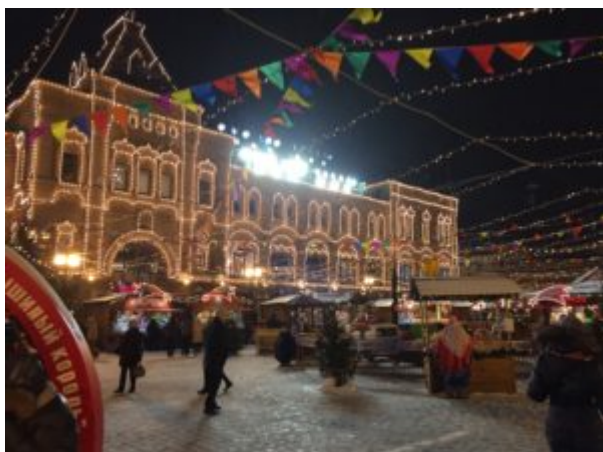
Bright lights on Red Square, Dec. 6, 2016.

Indeed, it was the Yeltsin era and its Western-beloved “shock therapy” that created the desperate conditions before the rise of Putin with his autocratic nationalism, which, for all its faults, has dramatically improved the lives of most Russians.