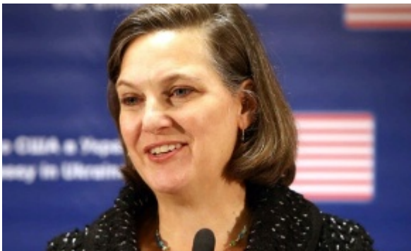
Assistant Secretary of State for European and Eurasian Affairs Victoria Nuland during a press conference at the U.S. Embassy in Kiev, Ukraine, on Feb. 7, 2014.

However, as with earlier “regime change” plans, the neocons and liberal hawks never think through the scenario to the end. They always assume that everything is going to work out fine and some well-dressed “opposition leader” who has been to their think-tank conferences will simply ascend to the top job.