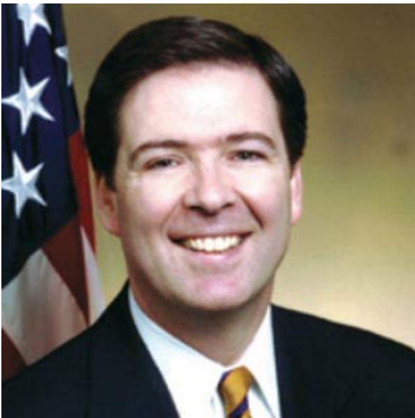
FBI Director James Comey

Rather than national party leaders taking the blame for pre-selecting a very flawed candidate and ignoring all the warning signs about the public's resistance to this establishment choice, Democrats have pointed fingers at almost everyone else - from FBI Director James Comey for briefly reviving Clinton's email investigation, to third-party candidates who siphoned off votes, to the archaic Electoral College which negates the fact that Clinton did win the national popular vote - and now to the Russians.