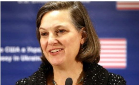
Assistant Secretary of State for European and Eurasian Affairs Victoria Nuland during a press conference at the U.S. Embassy in Kiev, Ukraine, on Feb. 7, 2014.

However, as with earlier "regime change" plans, the neocons and liberal hawks never think through the scenario to the end. They always assume that everything is going to work out fine and some well-dressed "opposition leader" who has been to their think-tank conferences will simply ascend to the top job.