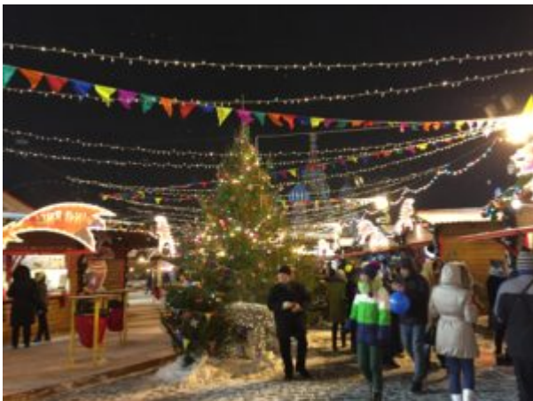
Wintery scene at Red Square in Moscow, Dec. 6, 2016.

By hyping the Russian “threat,” the neocons and their liberal-hawk sidekicks, who include much of the mainstream U.S. news media, can guarantee bigger military budgets from Congress. The hype also sets in motion a blocking maneuver to impinge on any significant change in direction for U.S. foreign policy under Trump.