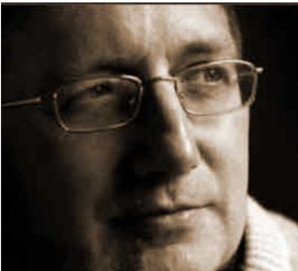
Former British Ambassador Craig Murray

Murray said he flew from London to Washington for a clandestine handoff from one of the email sources in September, receiving the package in a wooded area near American University.