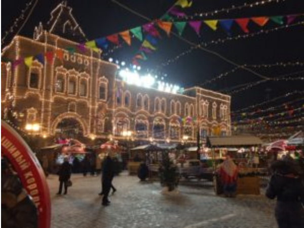
Bright lights on Red Square, Dec. 6, 2016.

Indeed, it was the Yeltsin era and its Western-beloved “shock therapy” that created the desperate conditions before the rise of Putin with his autocratic nationalism, which, for all its faults, has dramatically improved the lives of most Russians.