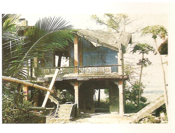
Local farmers at Phnom Chisor in 1988 pointed out what they said was 1973 U.S. bomb damage to the historic site's modern Buddhist wat, still unrepaired in 1988. Photo: Ben Kiernan, 1988.

revised our tonnage figure downward. For example, on March 1, 2010, in response to our question about how they had derived their tonnage figures, High explained their procedures for each of the two Pentagon databases in turn.