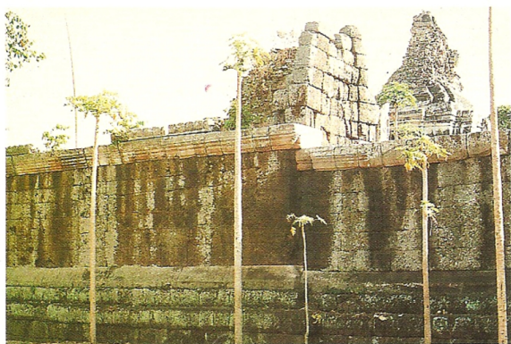
Angkor-era Khmer temple at Phnom Chisor, Takeo province, Cambodia.